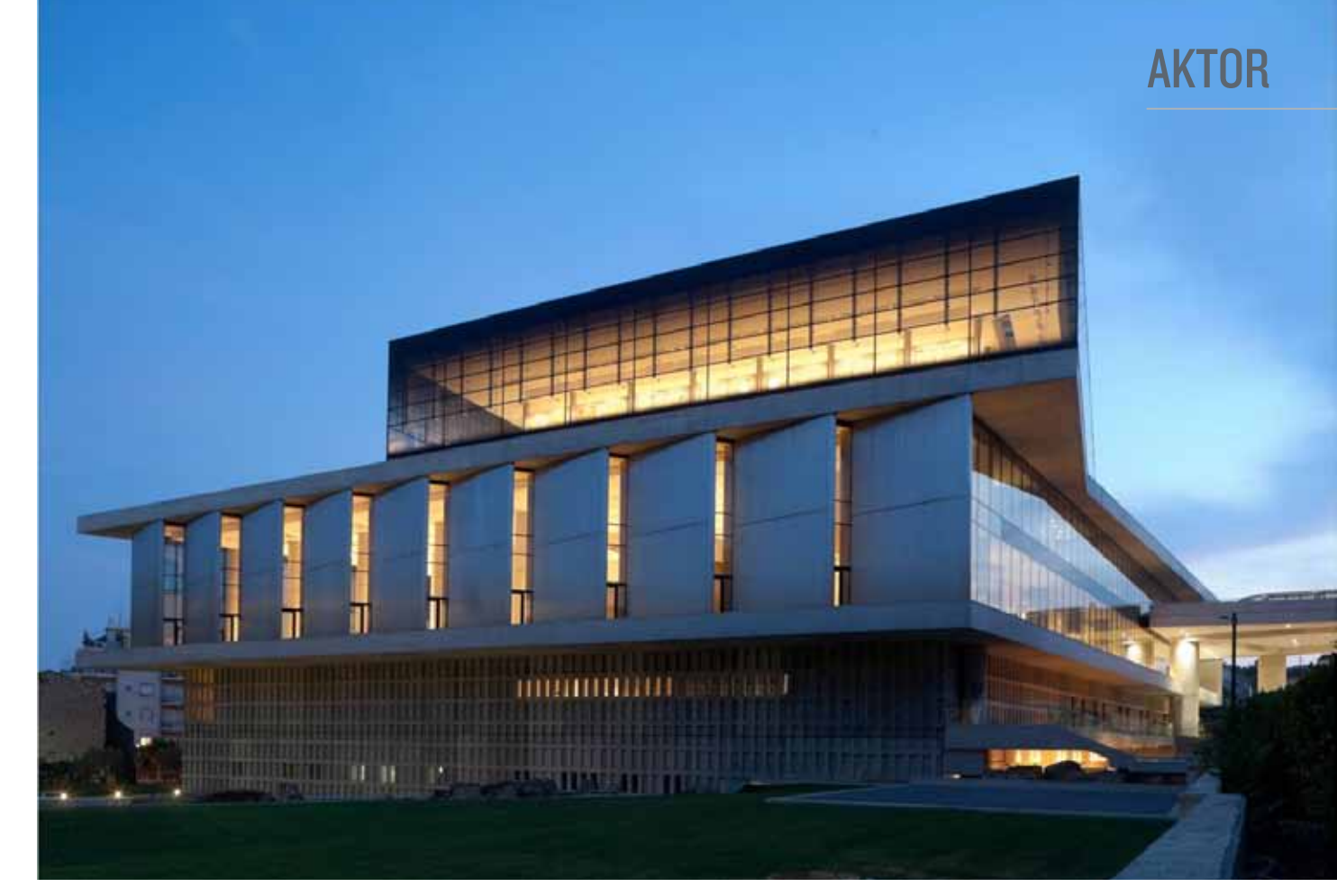
New Acropolis Museum

Internationally AKTOR was heavily involved in the building of the New Doha International Airport in Qatar, constructing the aircraft maintenance hangar, the service cargo complex, maintenance facility building, motor transport workshop and training centre, while it currently chases new opportunities in the country including Doha Metro. Meanwhile, in Abu Dhabi, the company has worked on several Phase 2 developments on behalf of Abu Dhabi National Exhibitions Company (ADNEC). These included the building of four exhibition halls, a multipurpose hall and two multi-storey car parks.