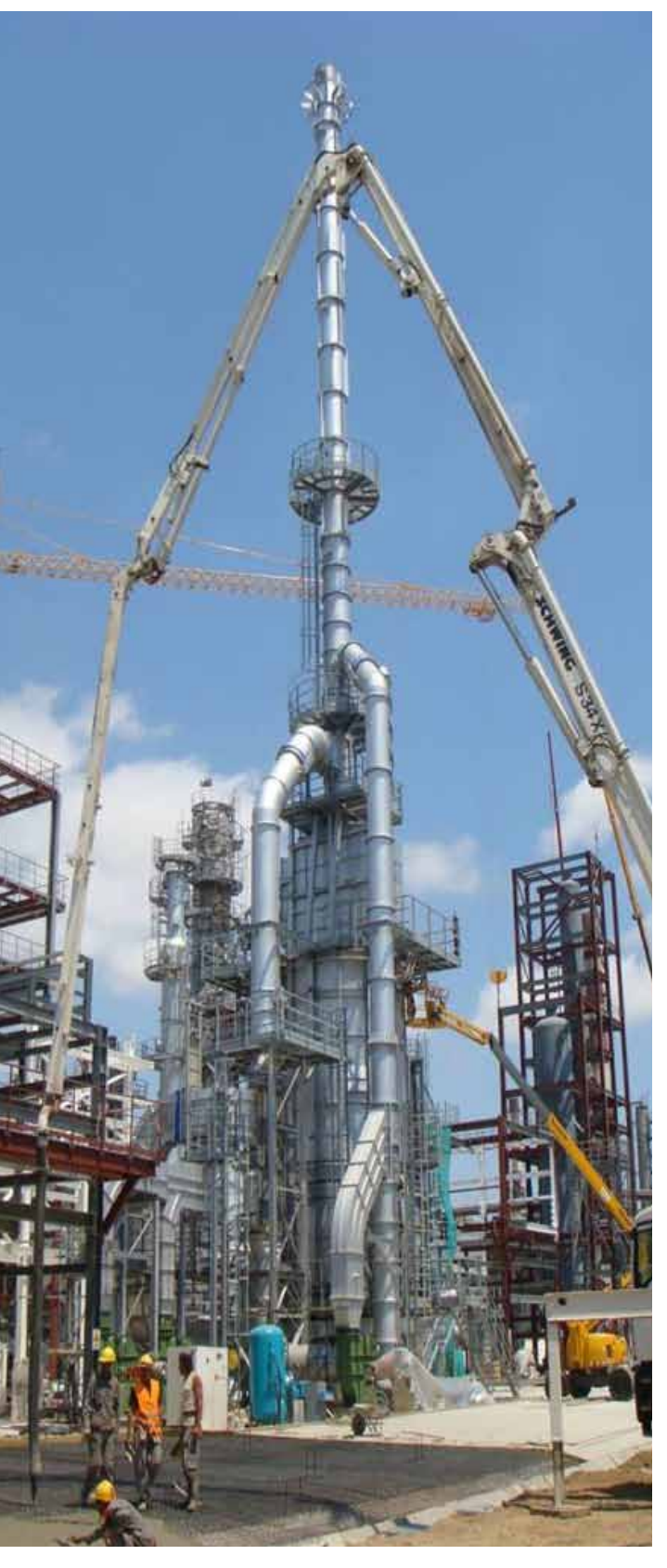
Lukoil Refinery, Burgas Bulgaria