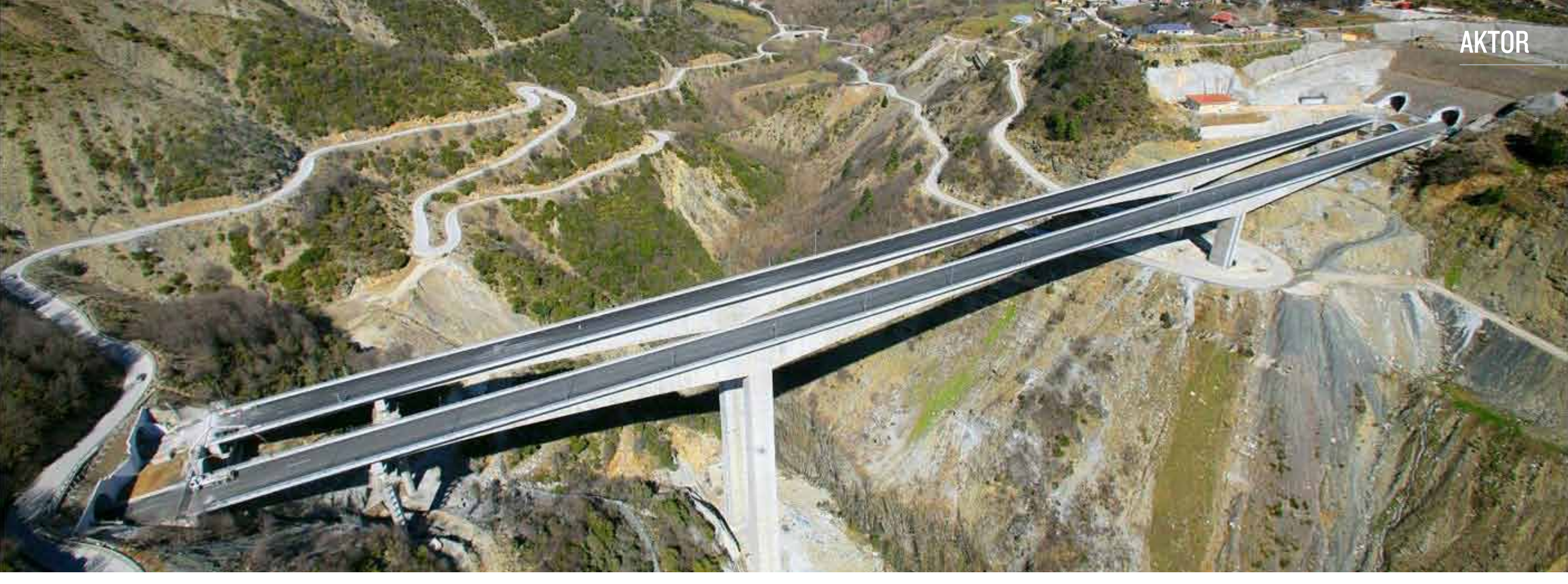
Egnatia Odos Metsovo Bridge