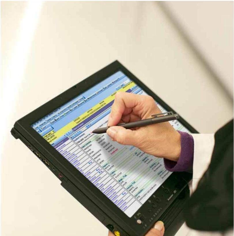
Clinical data is stored in one location