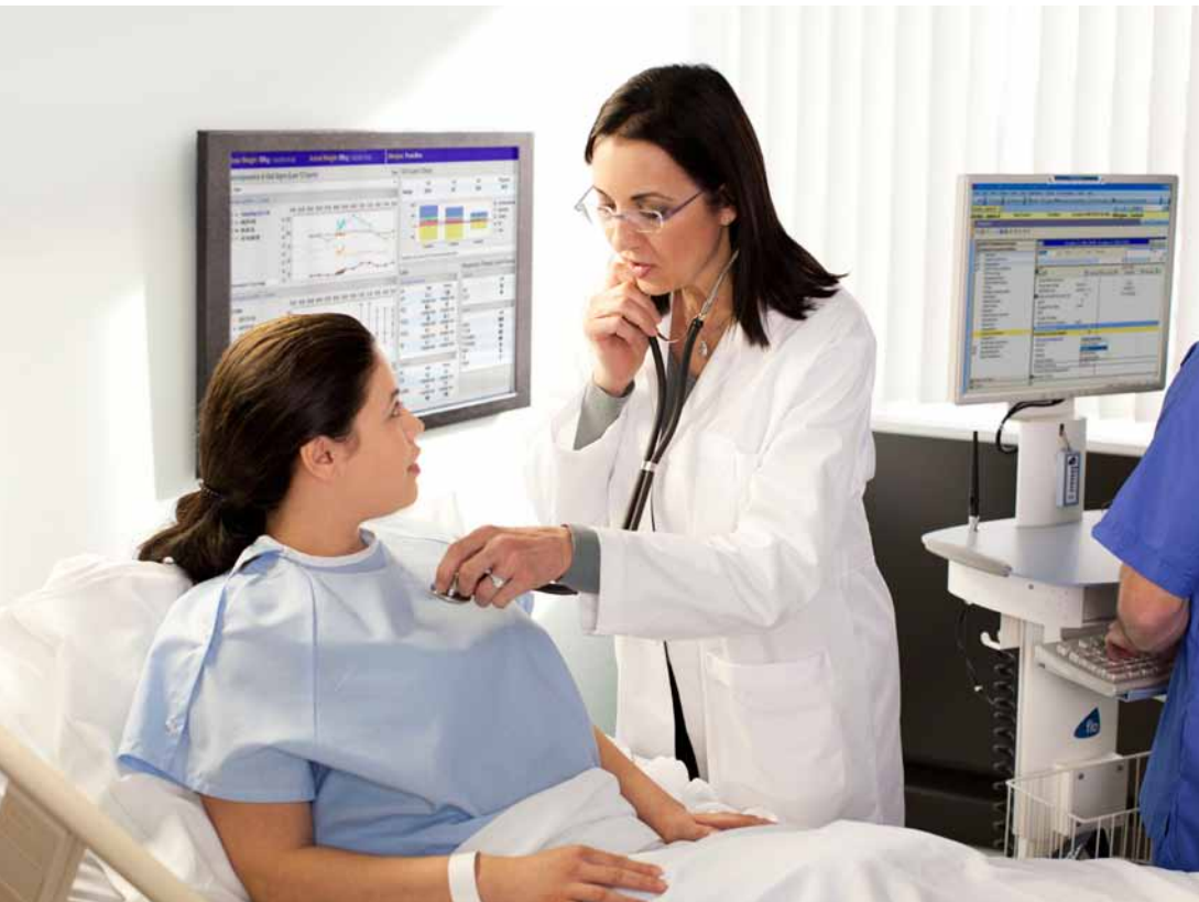
An electronic health record enables a holistic view of patient health