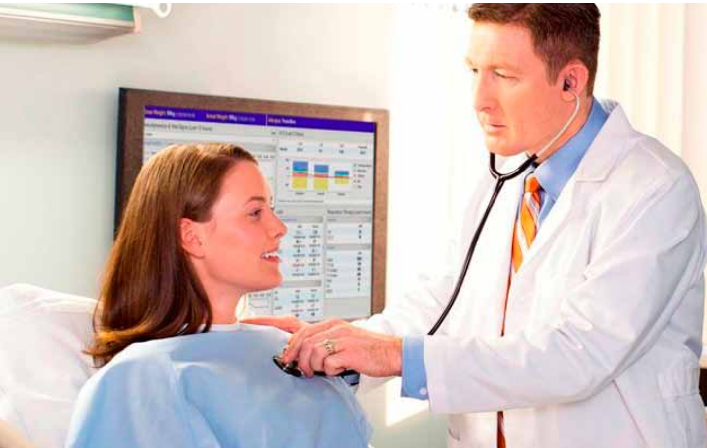
Cerner solutions provide real-time, measurable data

"IT ENABLES THE CHANGES THAT NEED TO BE MADE IN ORDER TO DRIVE A SHIFT IN OVERALL PATIENT HEALTH"