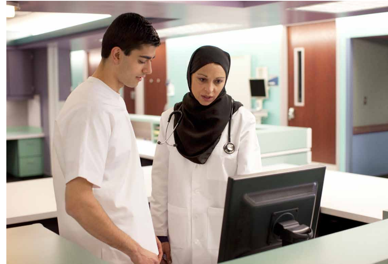
Investment in healthcare infrastructure is growing in the Middle East

systems to fully interact and coordinate with one another. Processes are streamlined, helping to reduce error, variance and waste—priorities high on the list for any health care provider. Cerner systems facilitate faster ordering, documentation and billing, resulting in a swifter, more efficient service.