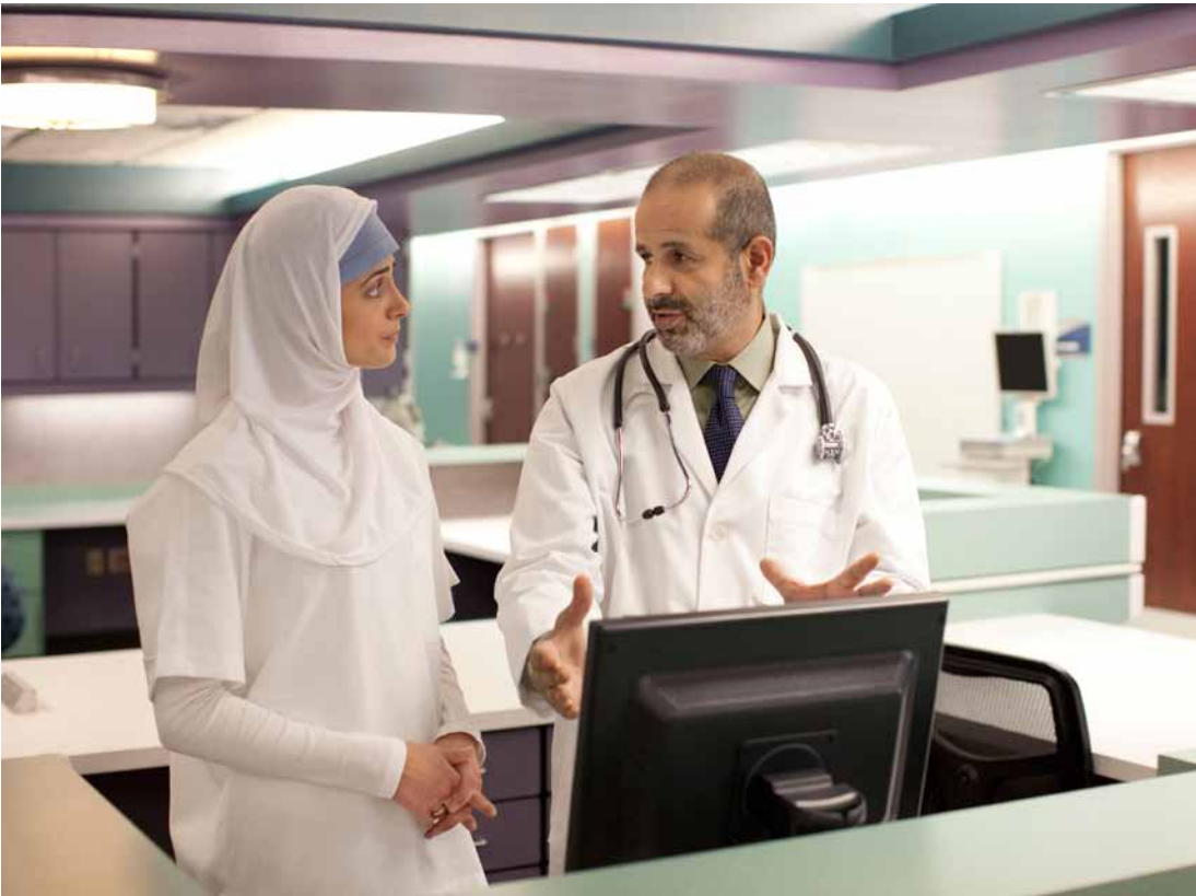
Care givers can make more informed decisions

are able to serve the needs of the entire spectrum of health care facilities, from small individual clinics to large hospitals and even national health systems. Earlier this year, the company signed a landmark agreement to digitise the entire health care system in Qatar, which encompasses all Hamad Medical Corporation (HMC)’s hospitals and primary health centres.