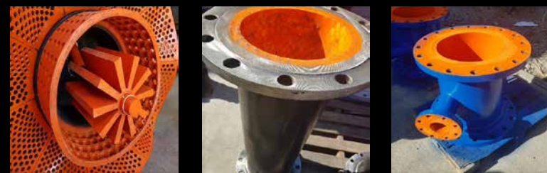
CONJUNTO CELDA FLOTACIÓN: Rotor + Difusor + Dispensor

Ductos y Reducciones de 4" hasta 48" diámetro, en Longitudes de hasta 6 metros.