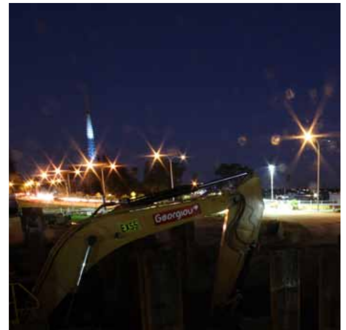
Early works on the main drain

Groundwater has been an ever present fact of life, he continues, since the work has been carried out so close to the river. In addition, the waterfront area is built on land reclaimed