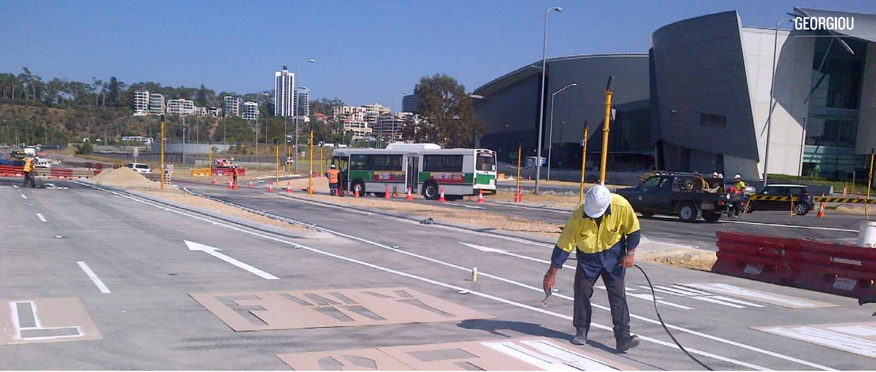
Linemarker preparing major road diversion

concrete storm water pipes that discharge into the Swan River. “It actually runs through the middle of our construction site, and would have run across the proposed inlet,” he explains. “As a result it had to be realigned down the middle of an existing road, William Street, across Riverside Drive and then to the outfalls in the river.”