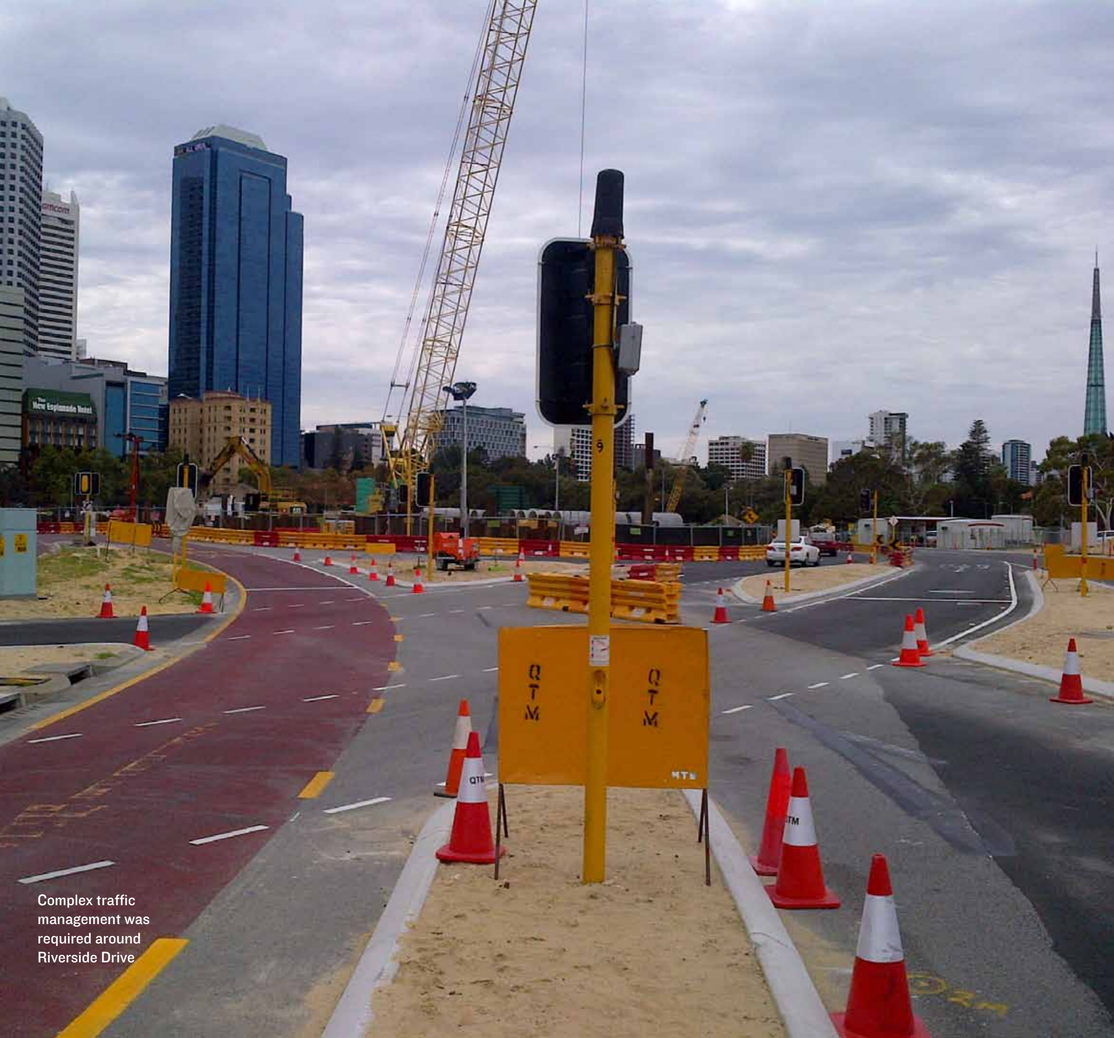
Complex traffic management was required around Riverside Drive

The Perth waterfront has been an under-used asset, but now Western Australia’s capital city is finally making the most of it with the $2.6billion Elizabeth Quay project covering nearly ten hectares of prime riverfront land between Barrack and William streets in the heart of the city. The project will create a magnificent precinct featuring a newly dug 2.7 hectare inlet surrounded by a split level promenade, shops, cafés, restaurants and other exciting entertainment venues.