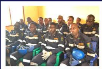
Nguvu Moja Security Officers appreciating their African Company of the year Award (ACOYA)