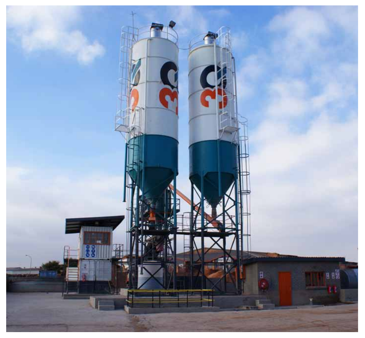
3Q Concrete aims to open three new batching plants in 2013

"While it is fair to say that we do run a tight ship," Marais says, "at the same time we consider ourselves to be a lean and mean operation. Our business model allows us to make money even when activity levels in the country decrease. Whereas other large companies often end up finding they become reliant on constantly high volumes of work in order to turn a profit we are unique in that we are equipped to ride the ups and downs of the market and remain profitable."