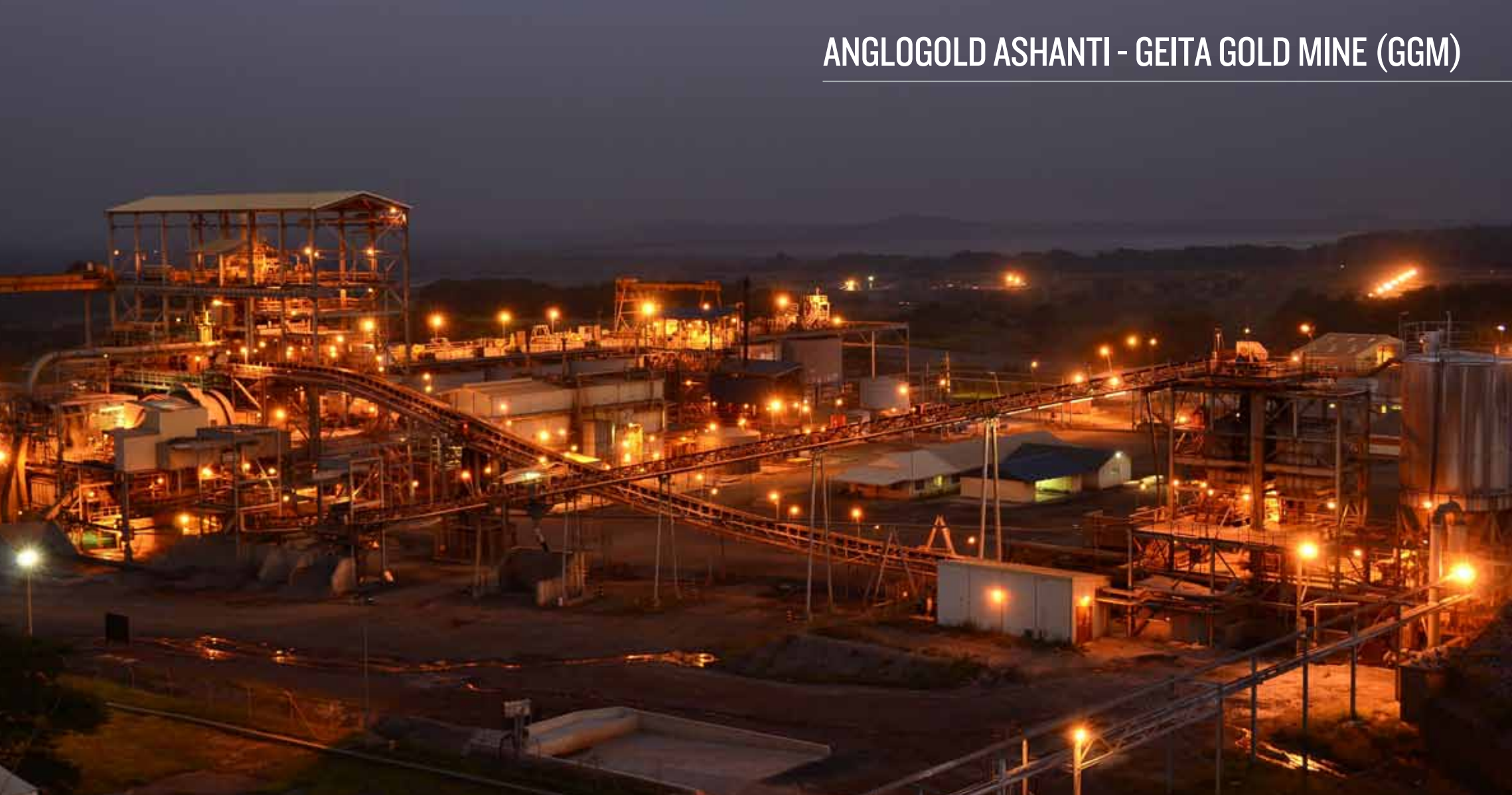
Aerial view of the mining operations

"THE MINE HAS PAID SOME US$683 MILLION IN DIRECT CONTRIBUTIONS TO THE TANZANIAN GOVERNMENT THROUGH TAXES AND ROYALTIES SINCE 2000"