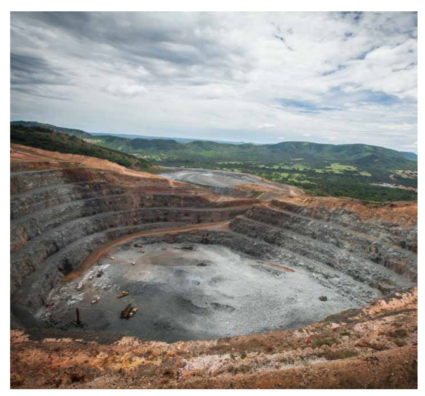
The open pit at Geita

integrated malaria control program in Geita. The Geita Malaria Prevention program, which covers approximately 19 villages annually, focuses on carrying out indoor residual spraying within the community and was responsible for offering this prevention to more than 90 percent of the target population. Furthermore, from an environmental perspective, GGM is understandably proud to have maintained ISO 14001 certification, which will remain valid until June 2016.