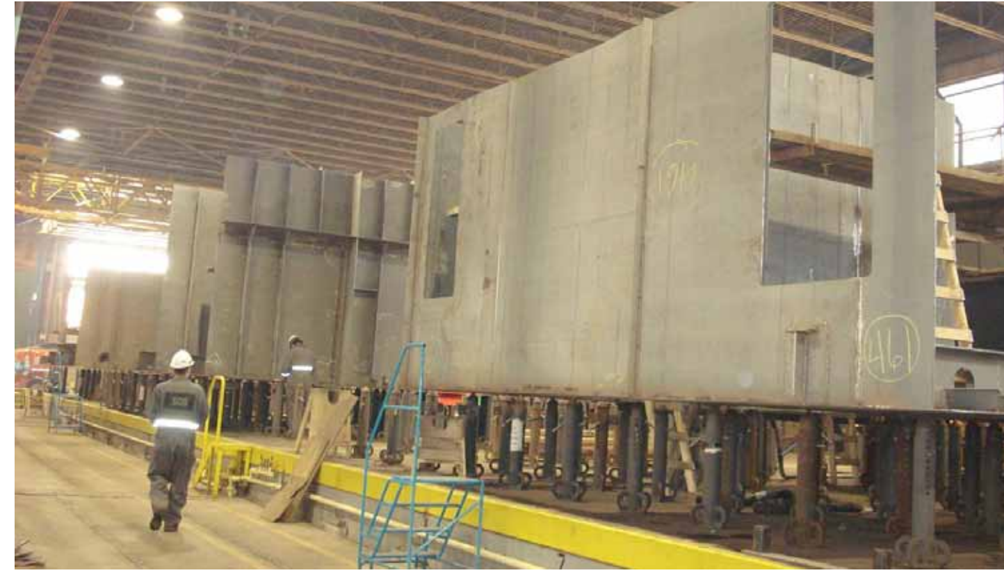
The fabrication workshop

capacity than Davie, with a steel construction capacity of around 70 tonnes a week against Davie's 300. Nevertheless there is still a lot of defence work to be contracted out, and in any case NSPS would have tied up the shipyard for many years to come, which may not have been the ideal situation for a company that could still mop up much of the requirement for auxiliary naval vessels, and in the immediate future the coastguard fleet and O&G exploration vessels. As the only Canadian shipyard with the capacity to take on these requirements it has a strong competitive advantage: if anyone wants to operate in Canadian waters for over a year the vessel has to be registered under a Canadian flag, meaning being built in Canada