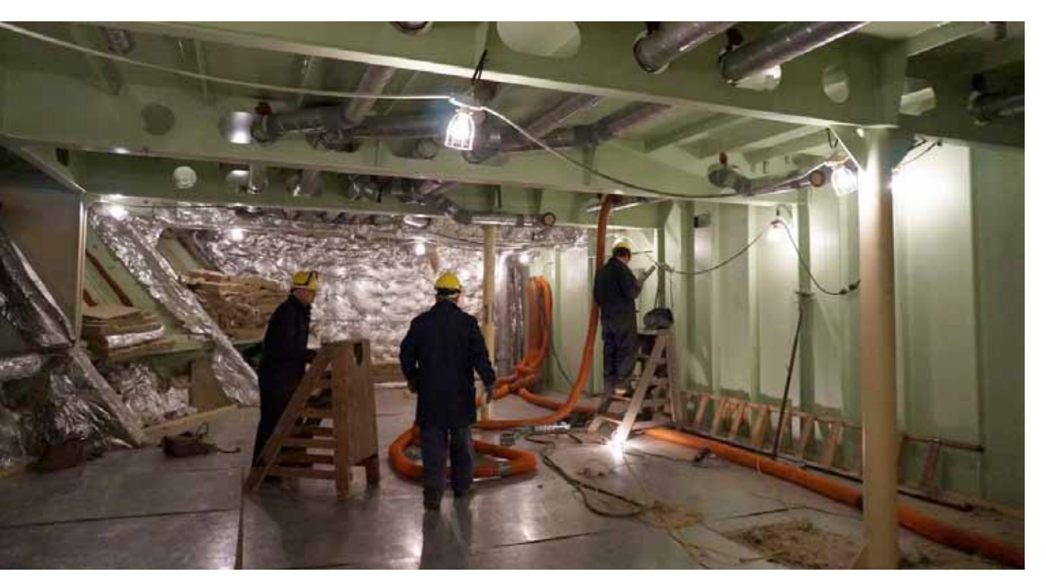
Working below decks