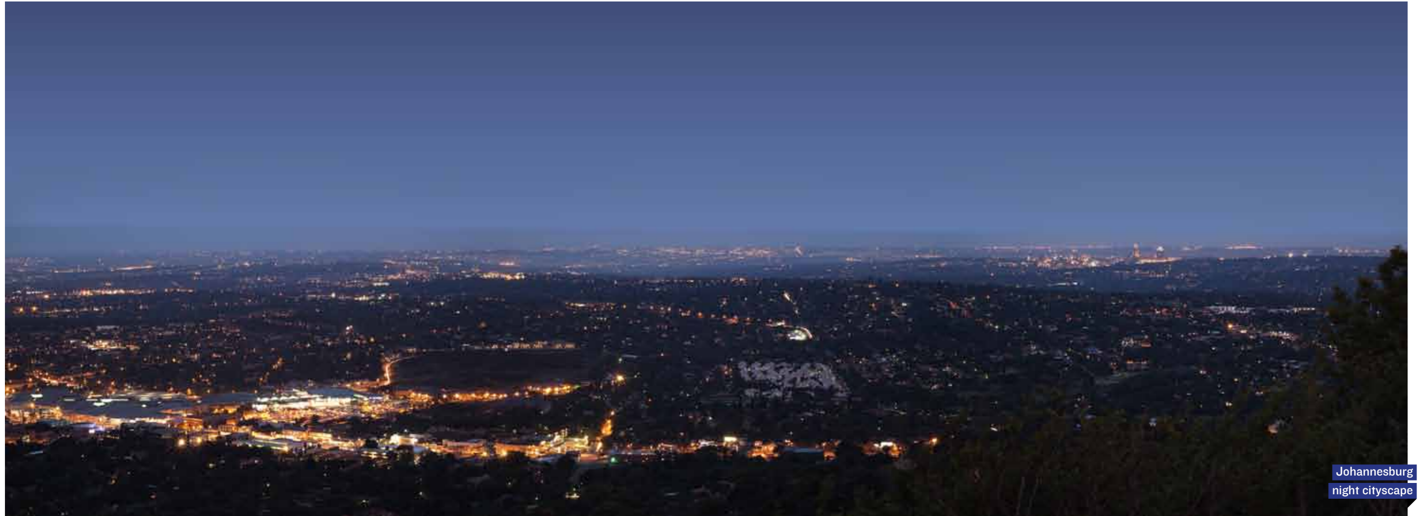
Johannesburg night cityscape