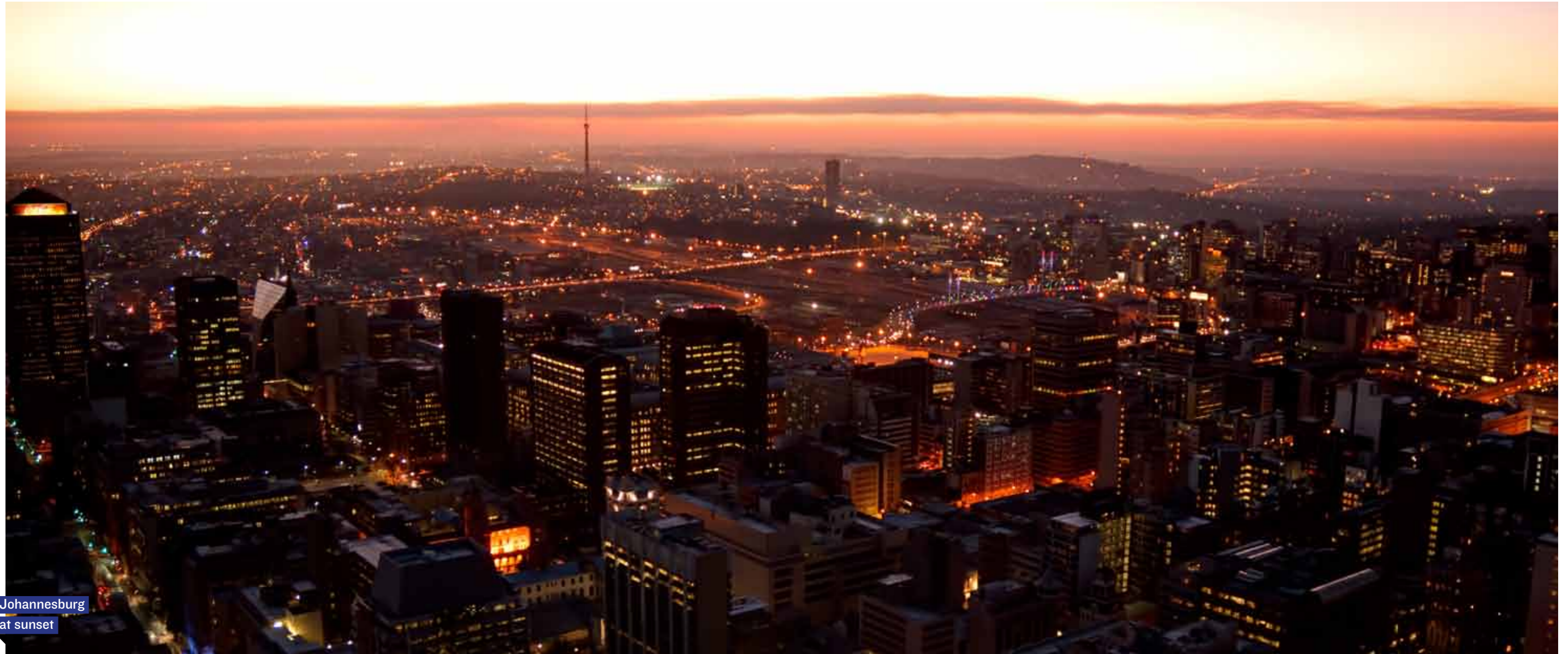
Johannesburg at sunset

L ocated in the eastern plateau area of South Africa known as the Highveld, Johannesburg is country's largest city by population and the provincial capital of Gauteng, which boasts the largest economy of any metropolitan region in all of Sub-Saharan Africa.