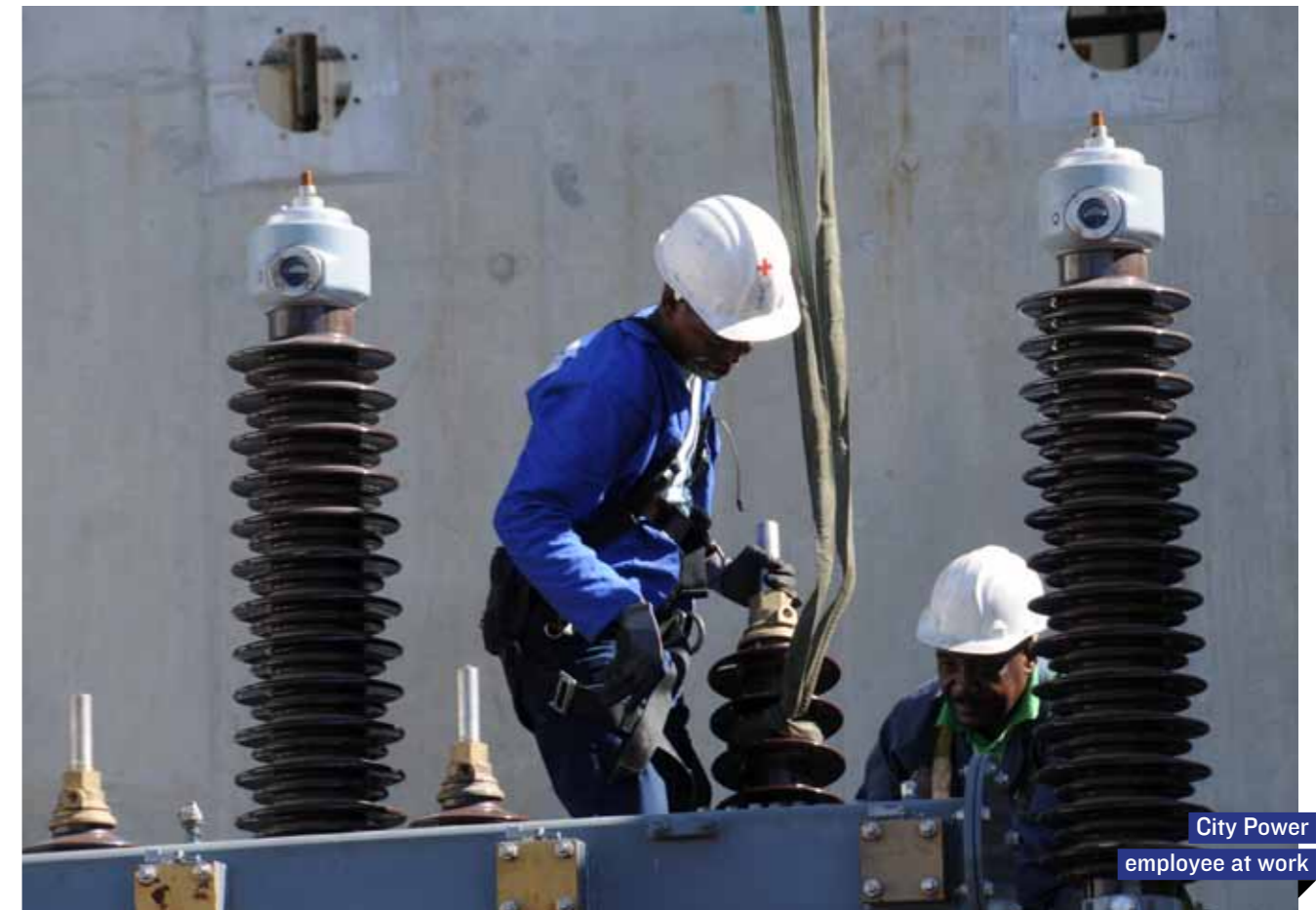
City Power employee at work