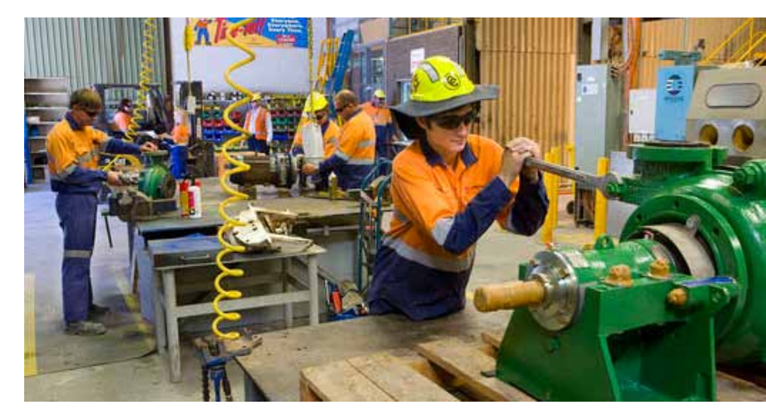
The company is committed to providing a safe and healthy workplace

Like all responsible corporate entities, Coogee Chemicals is aware of its requirement to meet the environmental, social and economic needs of the communities around which is operates. As well as its commitment to providing a safe and healthy workplace for its employees,