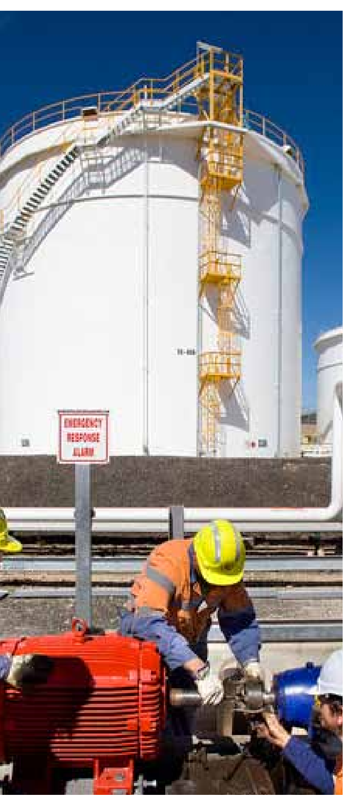
Coogee Chemicals operates bulk liquid terminal facilities