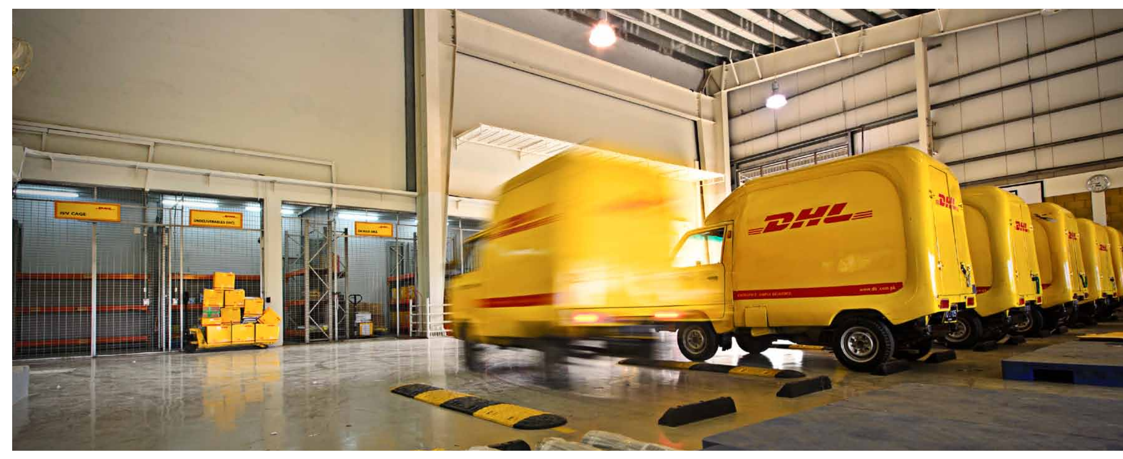
Environmentally friendly DHL delivery vehicles

he surely led by example to deter anyone from trying to impress him by working longer hours. "I then told them that if they were still working late in the evenings consistently, and yet not achieving the goals then it would be necessary to review the scope and the processes to identify areas of improvement." It was a promise he kept.