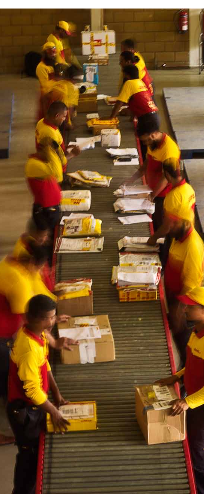
Direct sort and loading