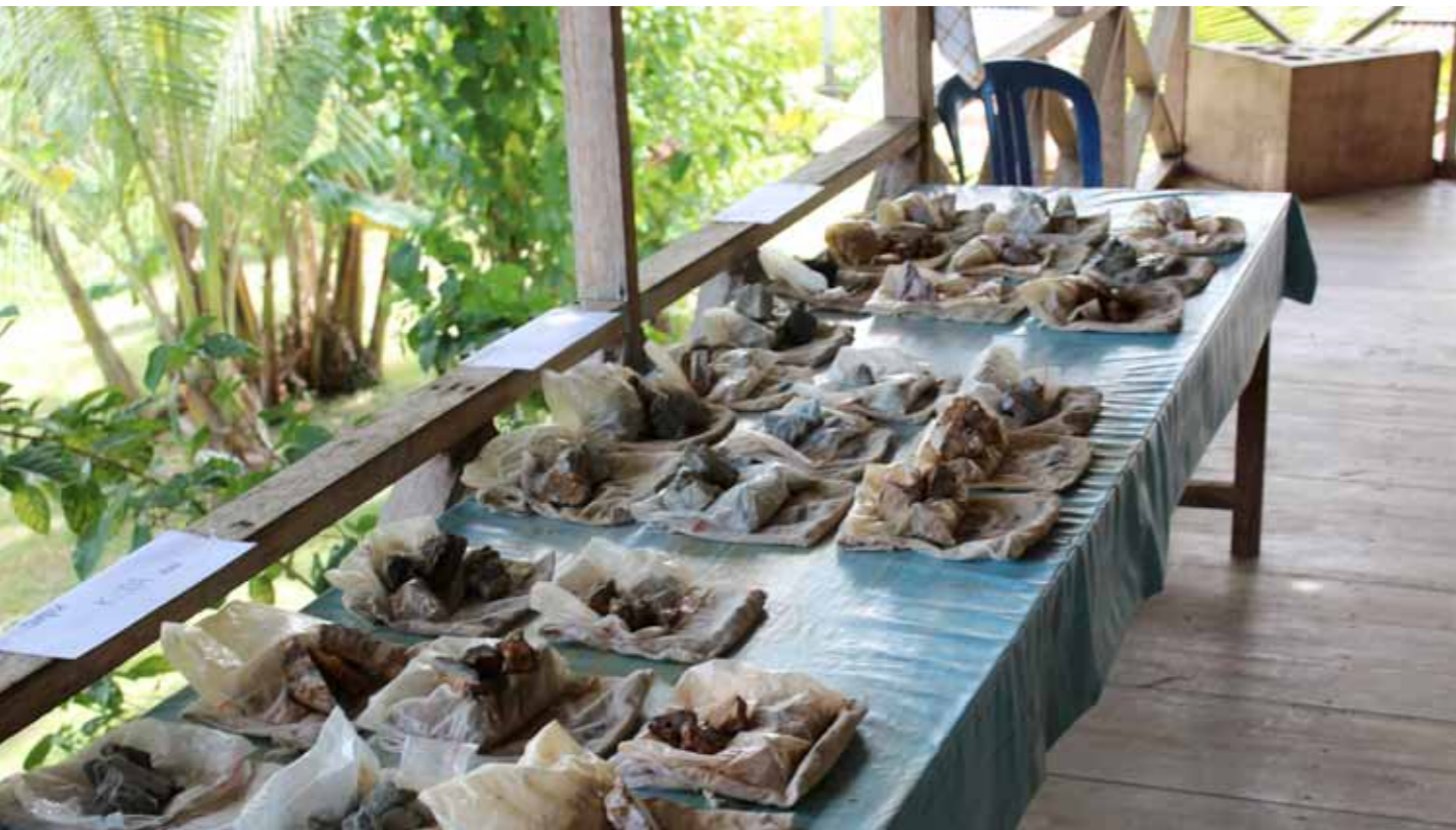
A collection of recent core samples

However the main threat has been the paper and pulp industry, plantation agriculture and logging. The strict regulations that have been rightly introduced are aimed at saving the remaining trees and wildlife habitat for posterity. But mining has a light footprint compared with other industries: drilling requires very few trees to be removed and any mining project comes with a robust rehabilitation plan. Compared to the palm oil