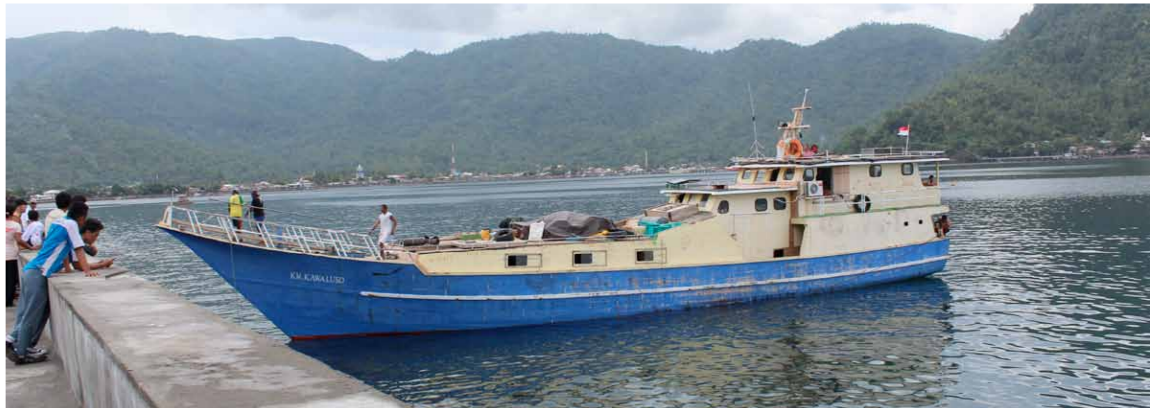
Local ship transporting relief supplies to earthquake victims across Sangihe Harbour