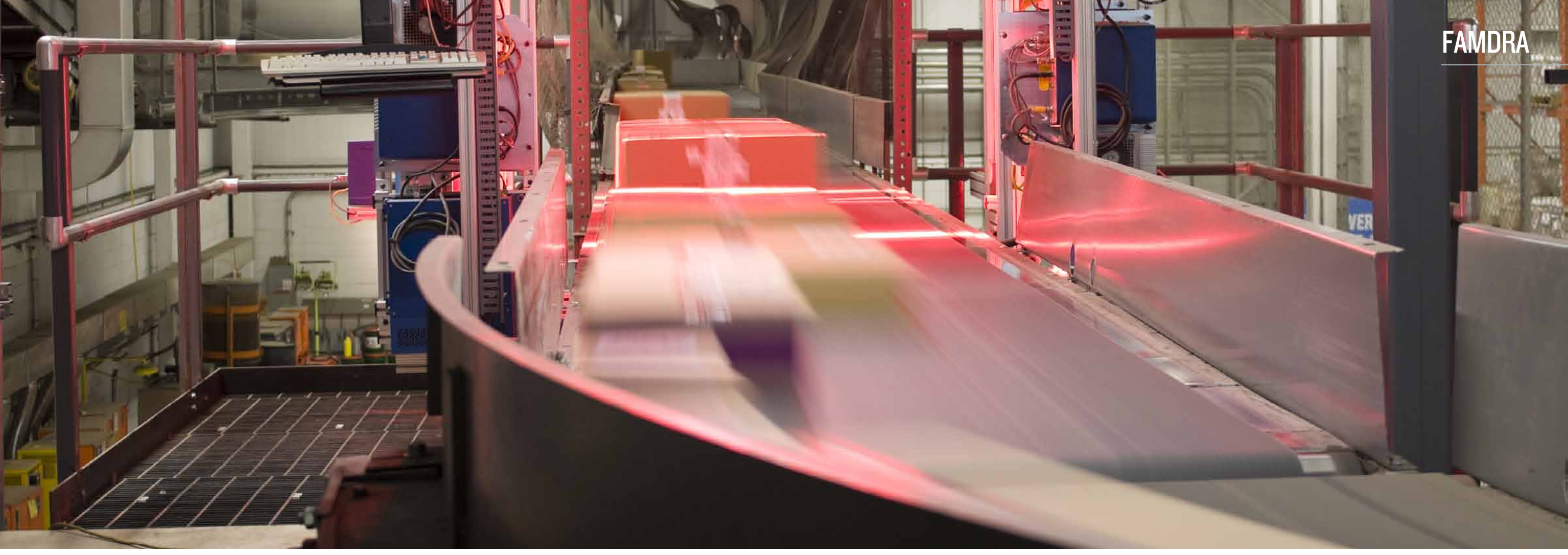
Famdra now wants to establish a global presence