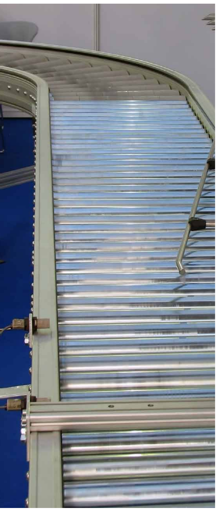
Conveyor weighing system