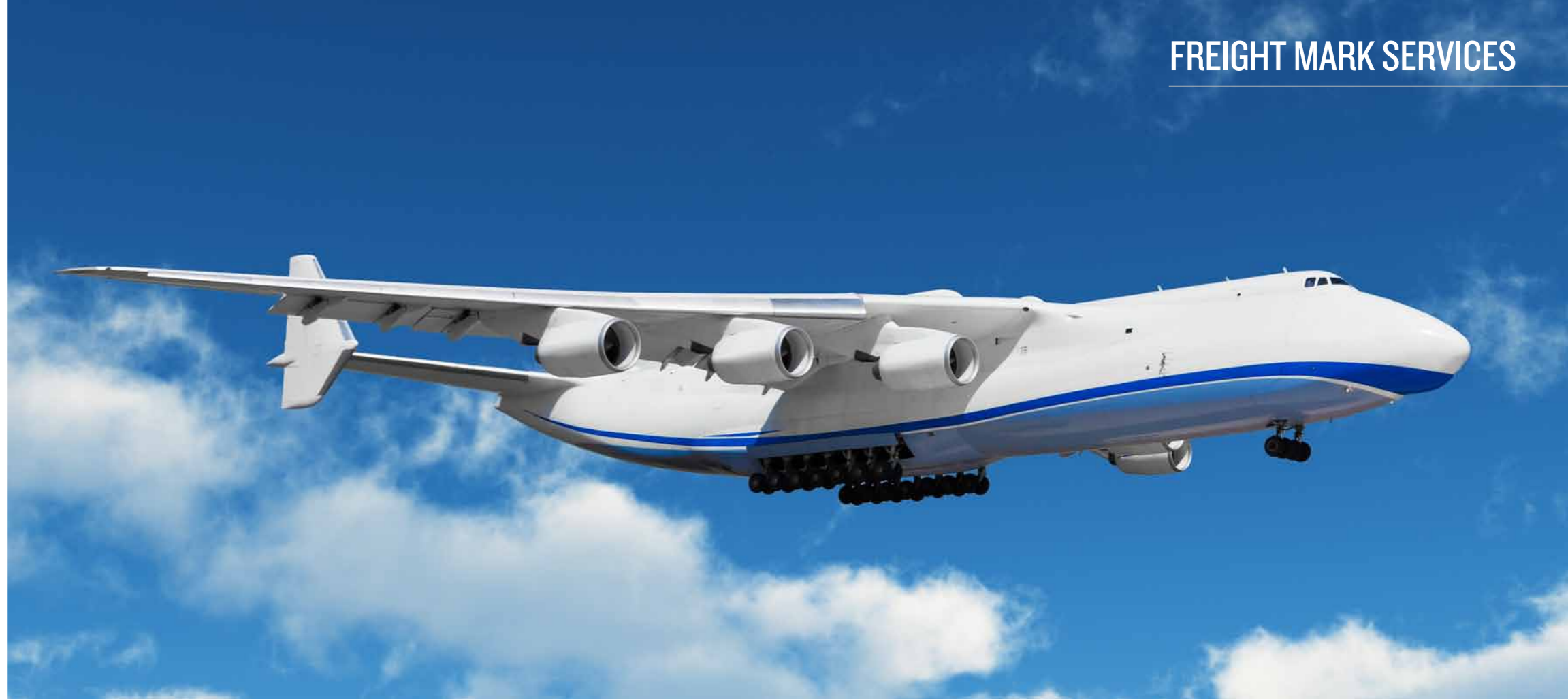
Quality, cost effective and efficient air freight services to or from major cities in Zimbabwe

On a day-to-day basis, though, it is the clearance of various consignments through