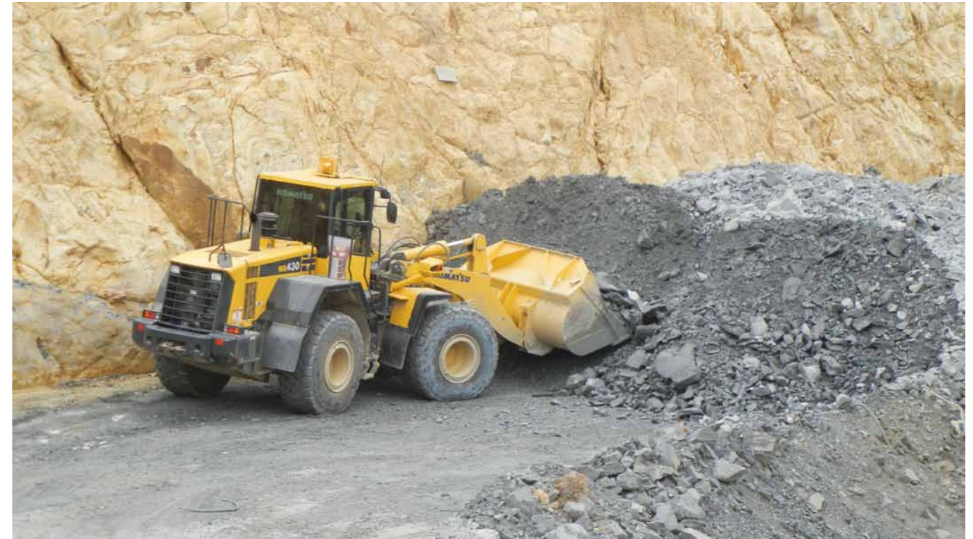
Wheel loader shifting rock