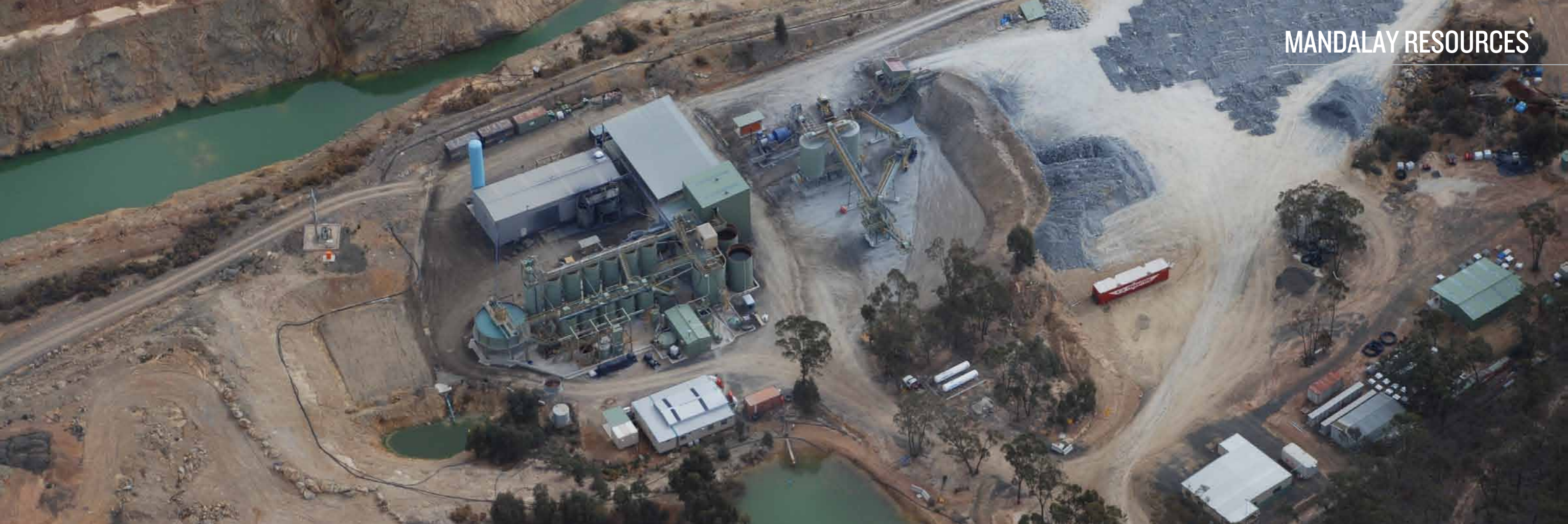
Costerfield aerial view