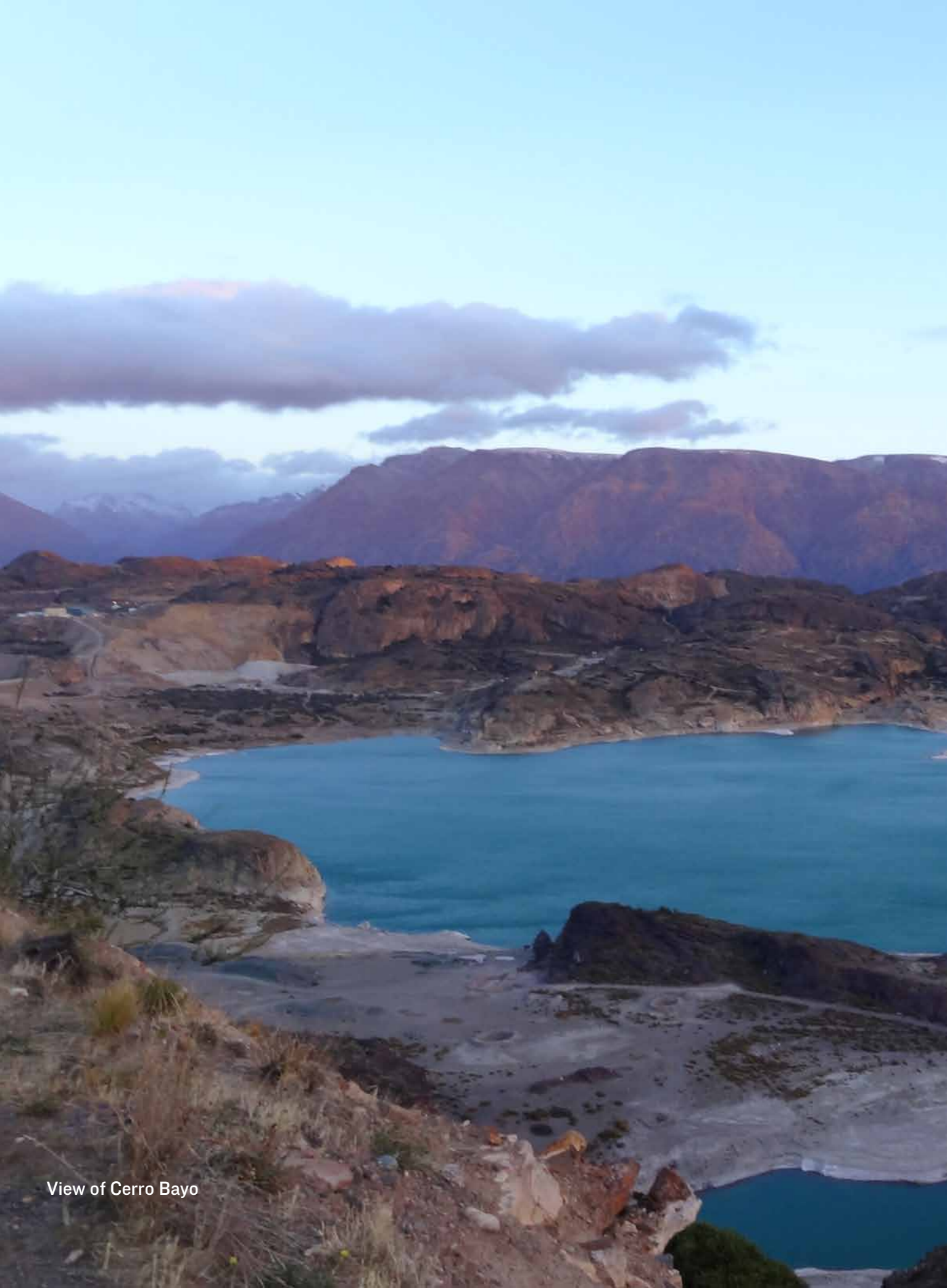
View of Cerro Bayo

With the global financial crisis of 2008, many mineral prices slumped, while gold, always considered a safe bet in hard times, continued to climb in value. In the aftermath of those turbulent times, huge opportunities have arisen for financially and operationally disciplined mining companies to enter the market and establish a significant footprint.