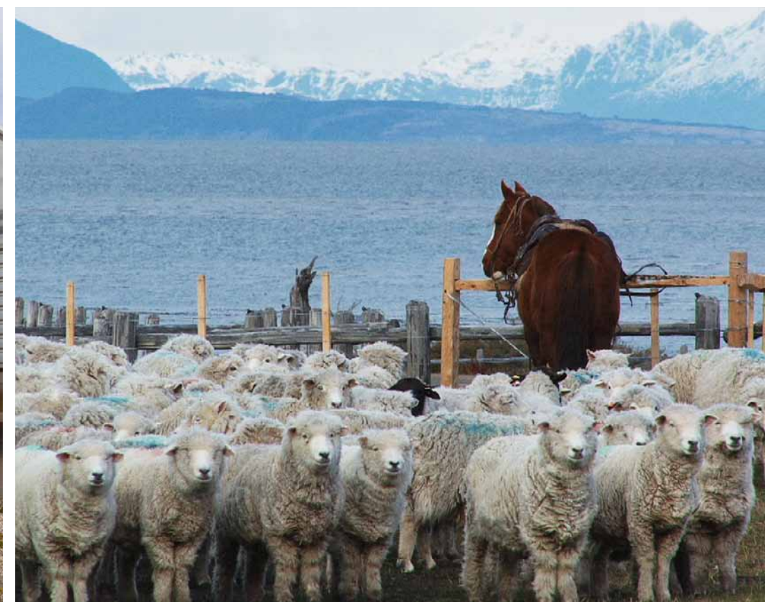
Invierno pit area