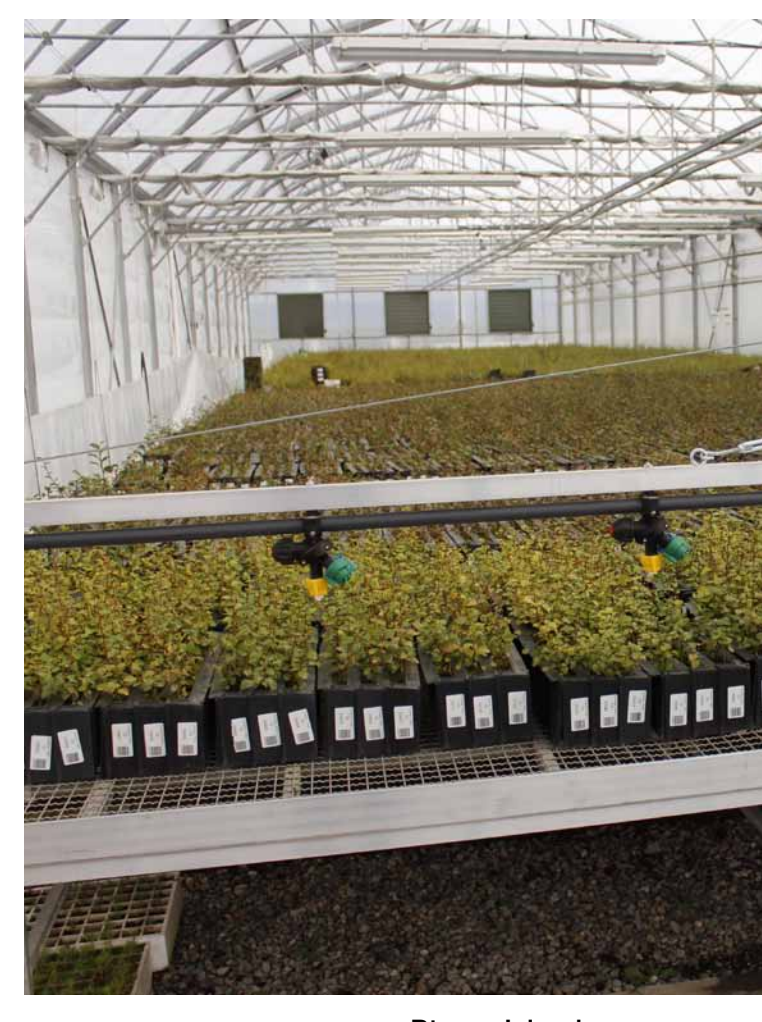
Riesco Island nursery

"THE PORT AT MINA INVIERNO WILL BE ABLE TO ACCOMMODATE SHIPS OF UP TO 140,000 TONS"