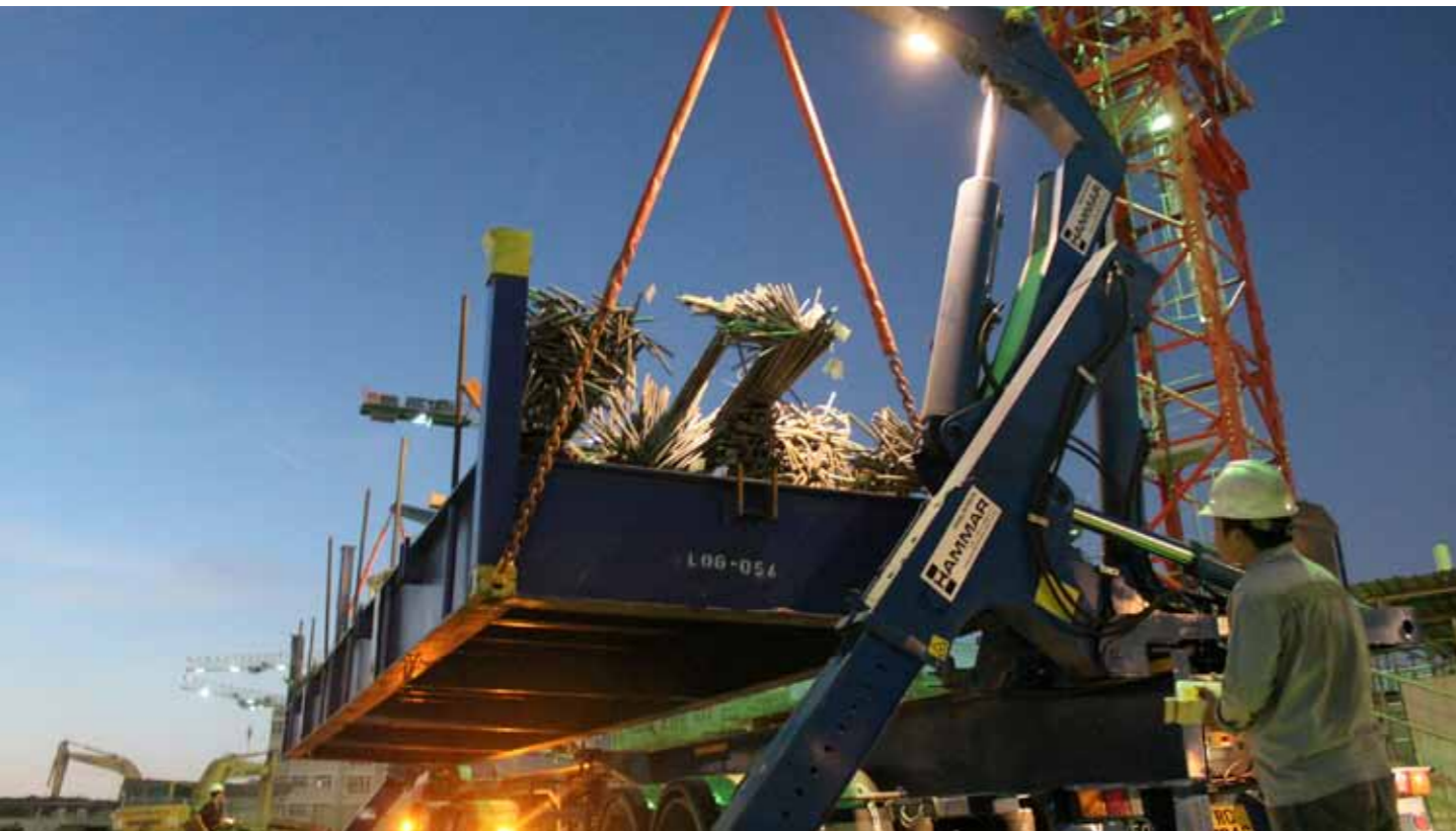
The Sidelifter system from NatSteel enhances the safety and productivity of material handling onsite

Furthermore, the customer was able to save a significant cost by eliminating material wastages and by reducing the level of manpower required onsite, while at the same time maintaining a safe working environment.