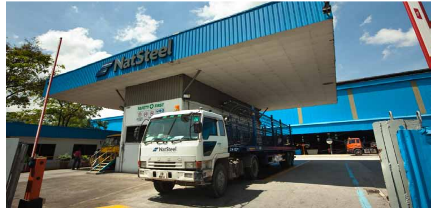
NatSteel's logistics service