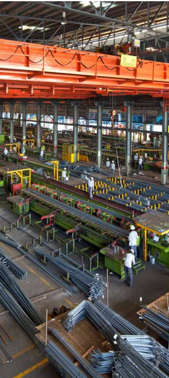
NatSteel's prefabrication facilities ensures consistent, high quality of products for customers

One of NatSteel's specialisations over the years has been its expertise in providing offsite prefabrication of steel reinforcement products and services. Across its Asian operations, NatSteel continues to witness several key trends that are driving the shift towards these, specifically the demand for higher productivity while maintaining safety standards, manpower constraints, space restrictions at construction sites, a demand for faster construction speeds and the need to reduce material wastage.