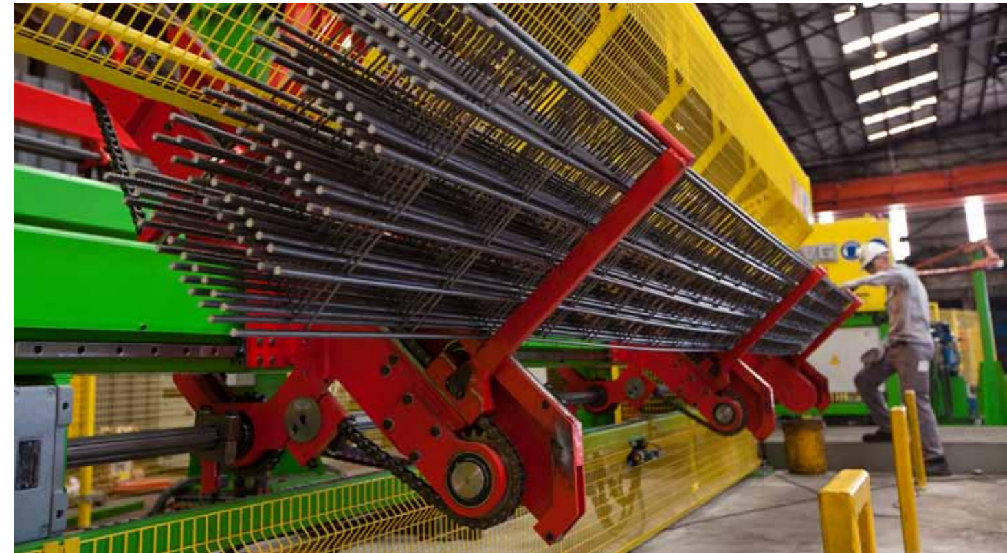
NatSteel's automated downstream facilities

“IT IS CLEAR THAT THE DAYS OF NATSTEEL SEEING ITSELF AS SIMPLY A STEEL SUPPLIER ARE IN THE PAST”