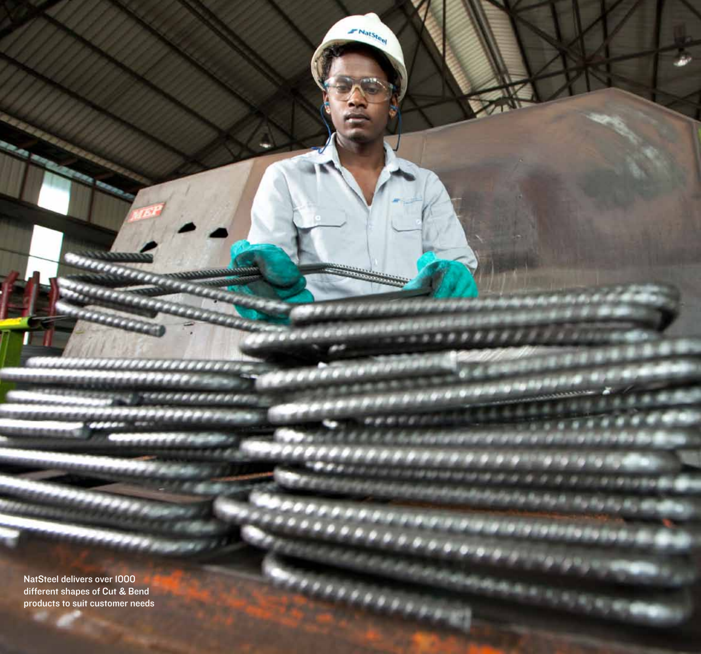
NatSteel delivers over 1000 different shapes of Cut & Bend products to suit customer needs