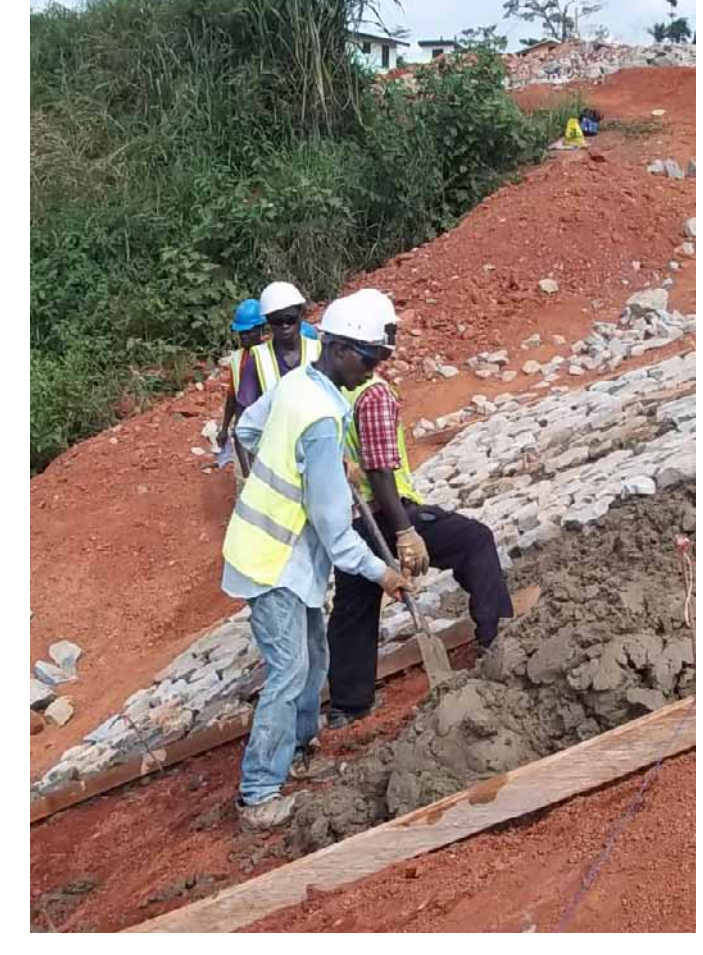
Stone pitching works