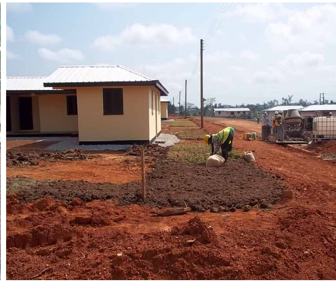
Top soil spreading by Gyifoss