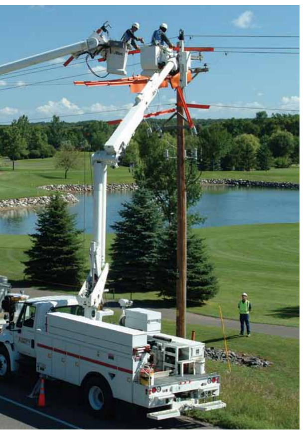
Altec insulated elevator trucks

today's mines this product is attracting a lot of interest he says. Among other recently supplied equipment are fire trucks and safety equipment destined for Codelco's Andina project, vacuum trucks for Siemens working at a Codelco/Rio Tinto joint venture, further vacuum trucks for services contractor Sierra y Plaza and telescopic cranes for the leasing company Relsa for the world's biggest