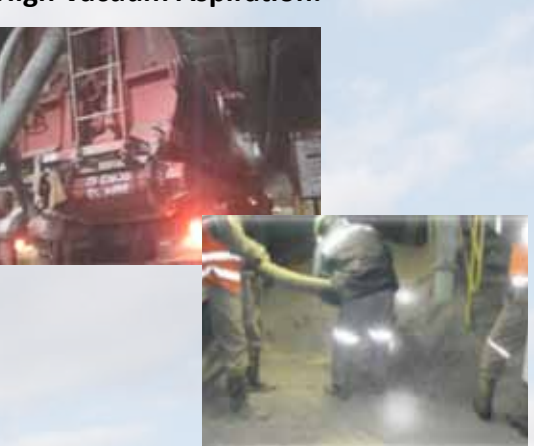
High Vacuum Aspiration.