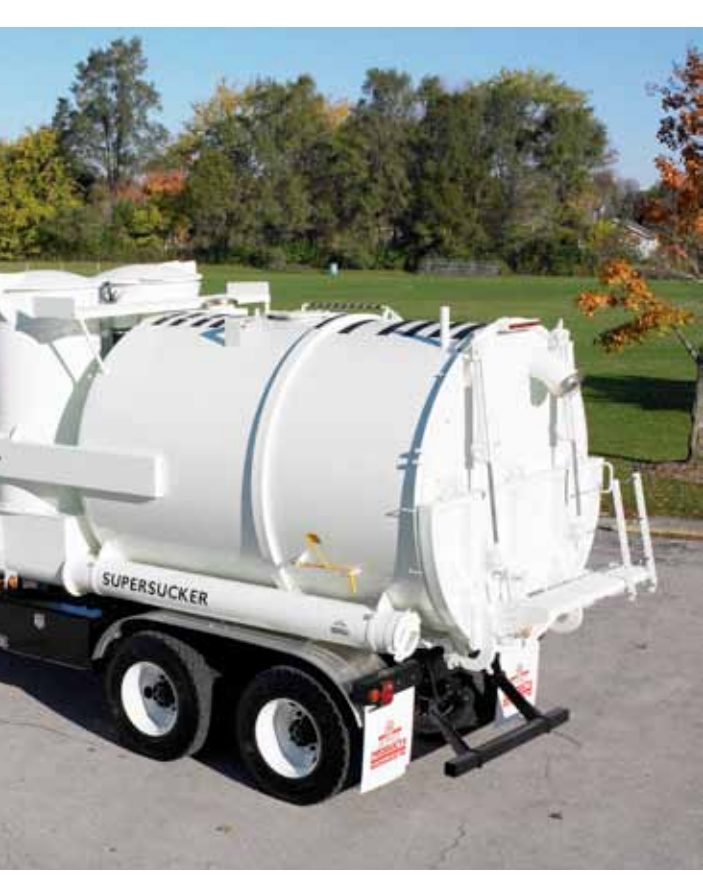
Supersucker vacuum truck

specialised equipment to Brazil if it had enough Mercosul content. Pesco already supplies a forest trailer to Uruguay, assembled in Chile using only key components that are imported. That model could be extended, he believes, with Chile becoming a platform for supplying such equipment, value added, to many South American countries, with no duty.