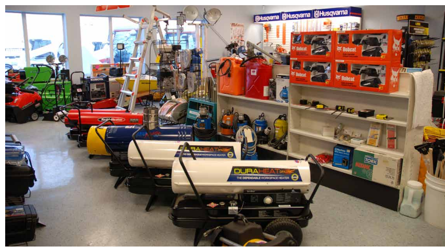
Equipment rental is a core business activity

Transportation in the north is also a trial. At times, pulling out all the stops, the very minimum delivery period to Yellowknife can be as much as three or four days. When flying is possible it is too expensive for run of the mill deliveries so most things come by truck. To get across the McKenzie River in summer means a ferry ride. In winter, the ferry manages to break up the ice long enough for an ice road to be constructed across the river at which time the ferry is mothballed until spring. But when the ice begins to melt, there is a period when there is neither ice road nor ferry, and consequently no deliveries except by air. While the McKenzie River bridge, scheduled for completion in late 2012, will improve the reliability of deliveries, the