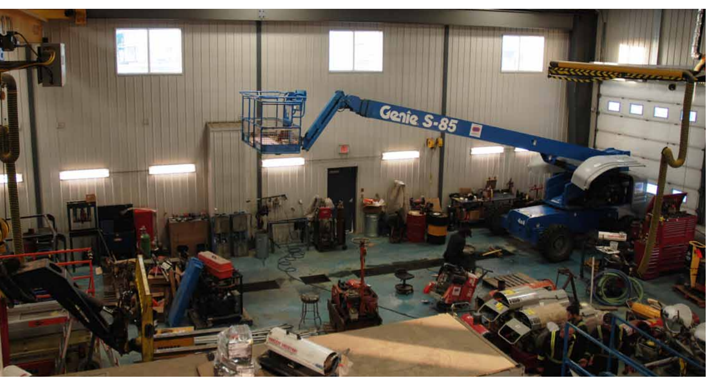
Keeping things working is a key strength