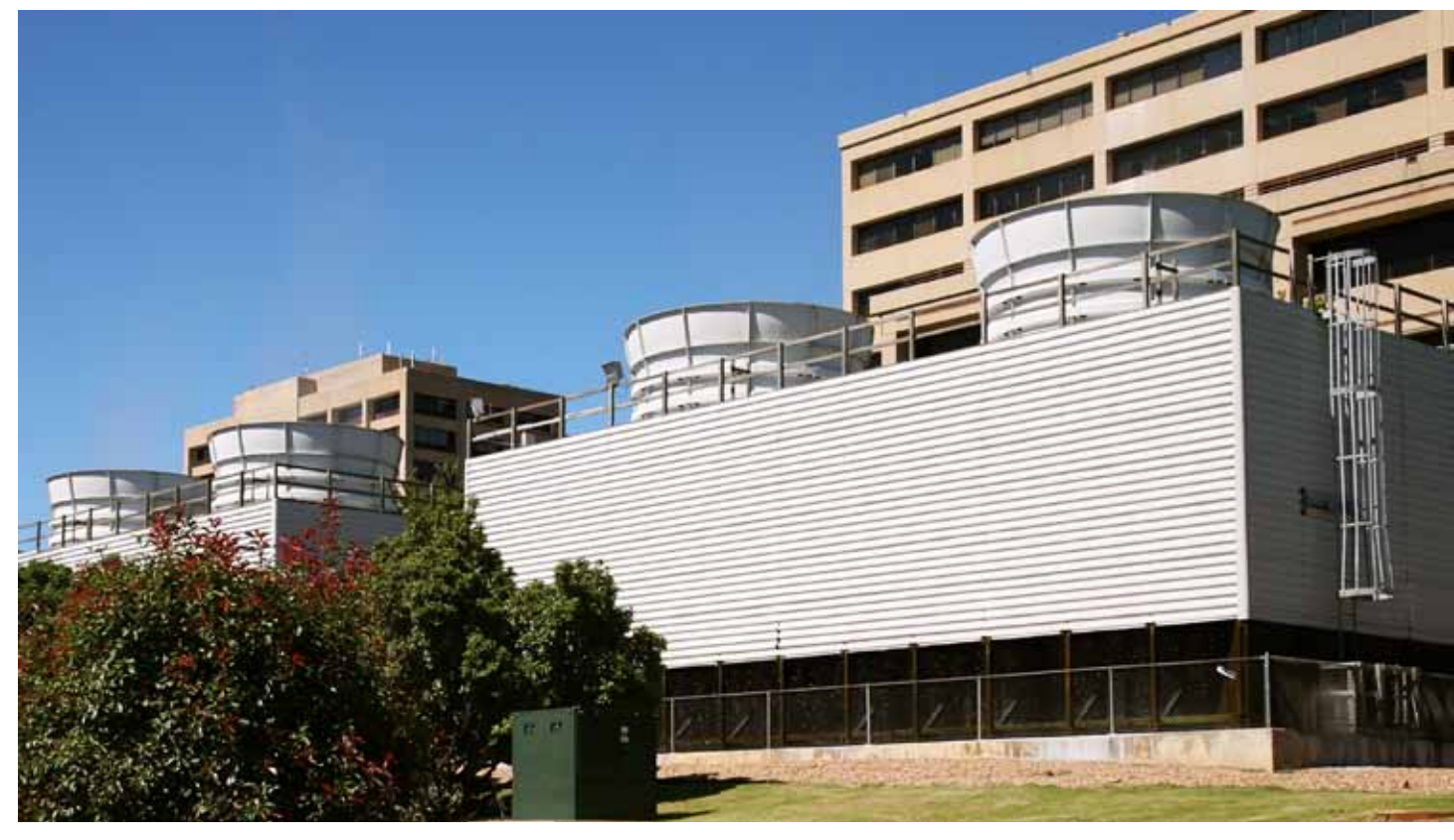
Marley Series 400 Cooling Tower

simply adjusting operating conditions like total water flow, hot water temperature, cold water temperature, wet-bulb temperature, drift rate, and concentrations to match each individual scenario.