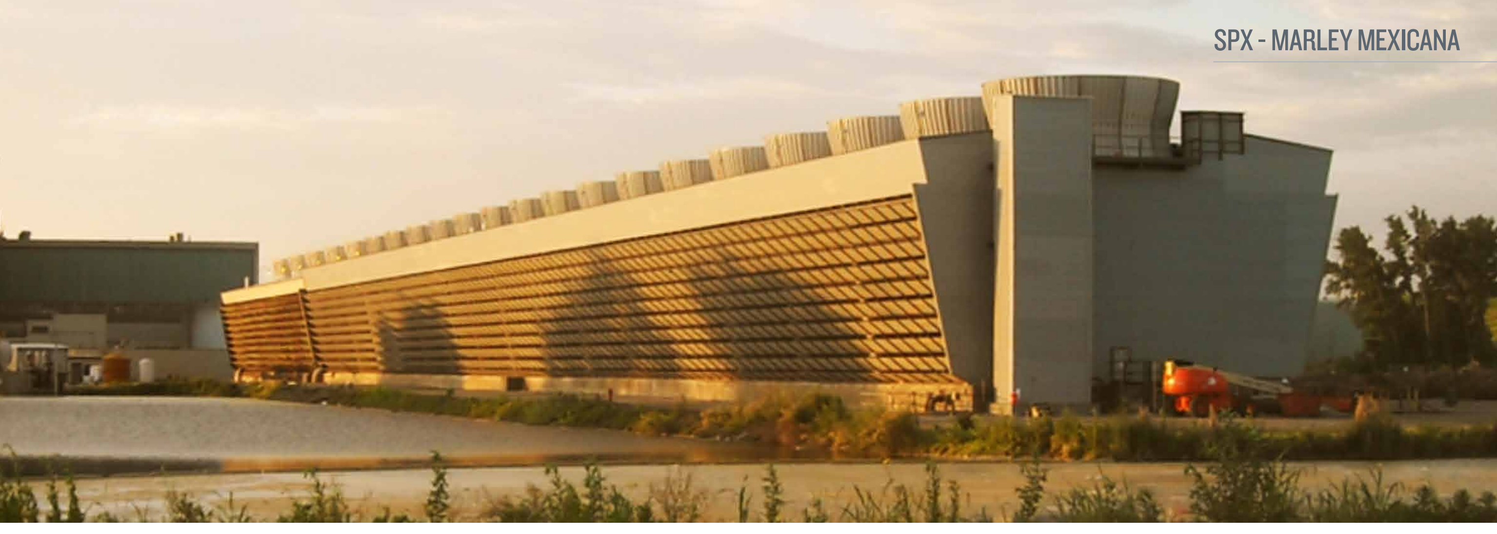
Marley Series 600 Cooling Tower

The company first opened its Mexico office, from which Marley Mexicana continues to operate, in 1960. Ever since it has been the leading regional force when it comes to cooling tower technology and sales, and has been responsible for installing towers into many of the country's most important power plants on behalf of Comision Federal de Electricidad and Petroleos Mexicanos.