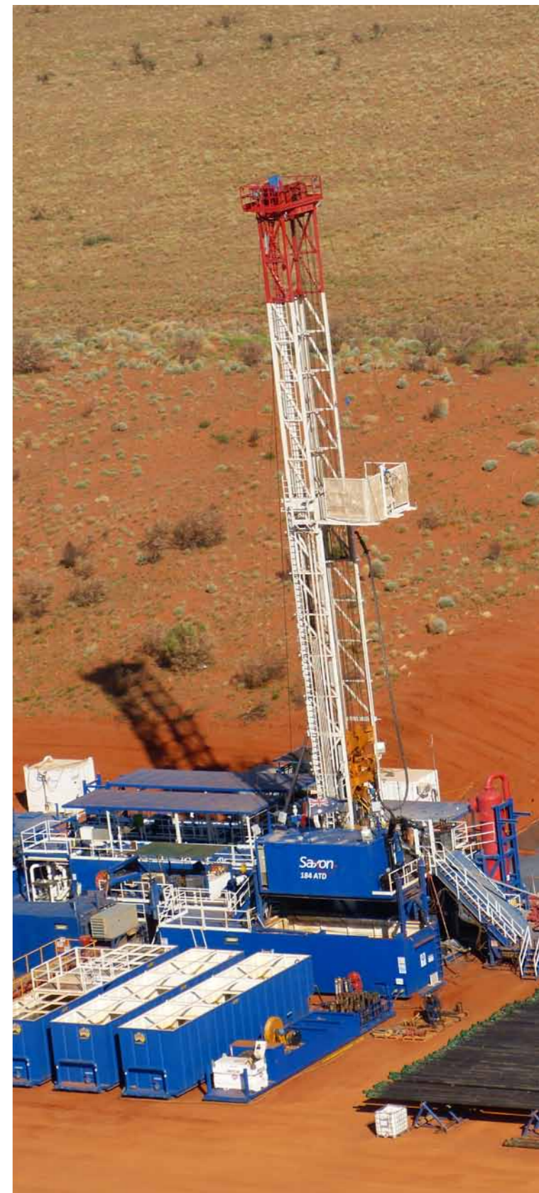
Saxon rig in Cooper Basin, Australia

The rigs are designed to be moved from one well to another using the available oilfield winch trucks and without the need to bring in cranes. At a single stroke, the cost of moving the rigs from well to well in this