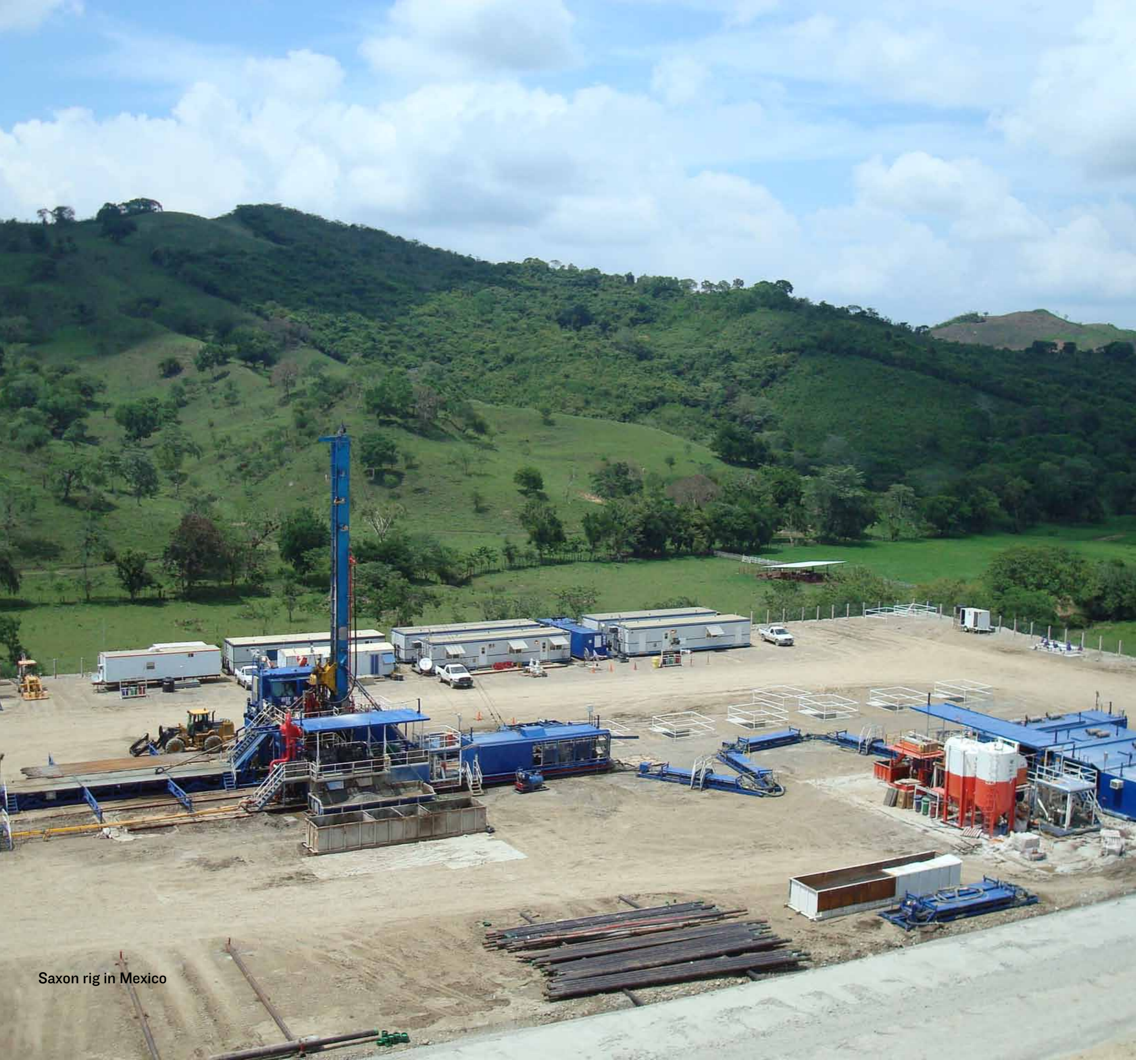
Saxon rig in Mexico

The Saxon mantra is 'Fit For Project', and its latest Advanced Technology rigs, the ATD (Advance Technology Double) and ATS (Advance Technology Single) were found ideal for the conditions found in the Cooper Basin and the Queensland coalfields. Nevertheless this is a competitive market, and even these advanced technologies