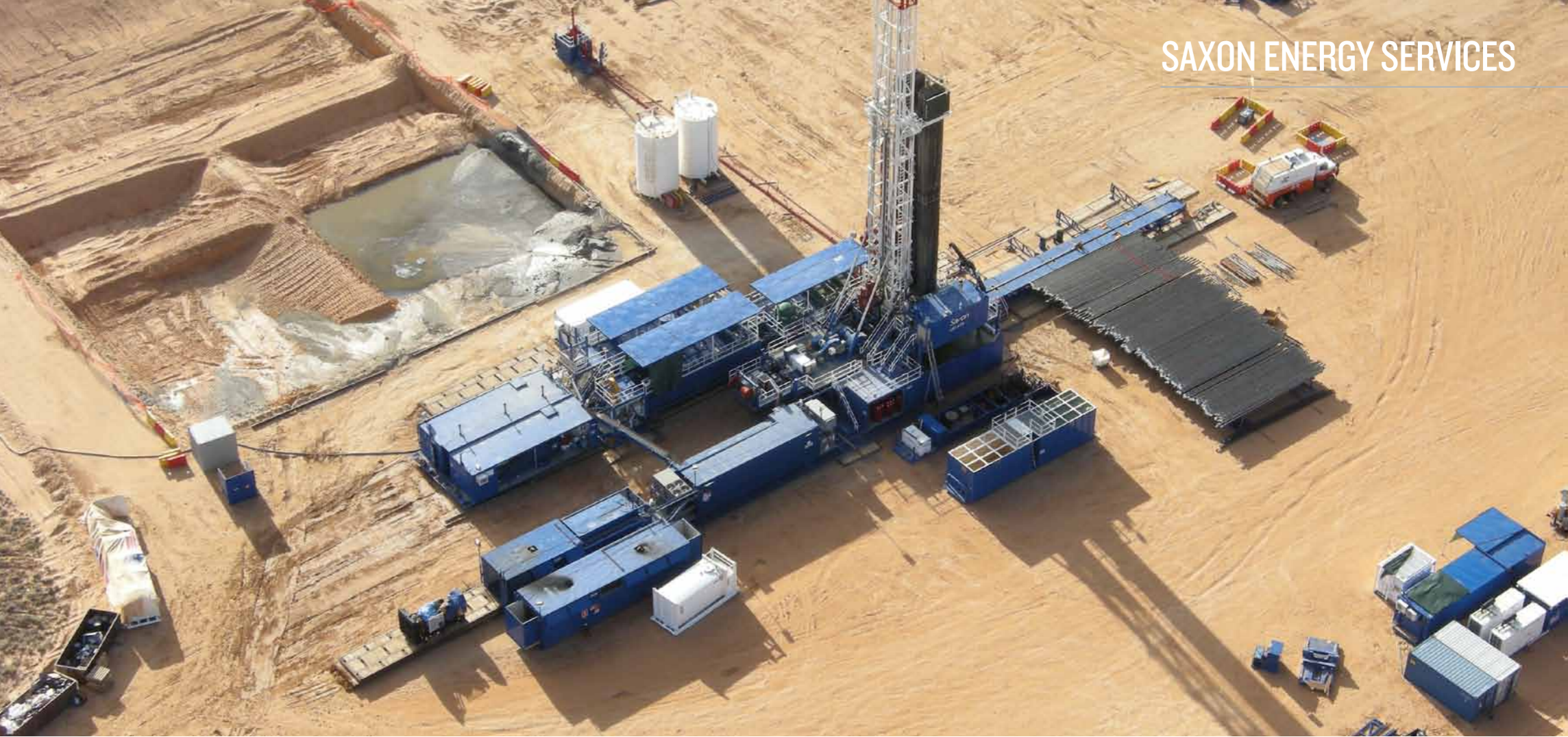
Aerial view of Saxon rig

inaccessible part of Australia is reduced, the proportion of productive drilling is increased, and the risk of personal injury while disassembling and reassembling the rigs is brought down.