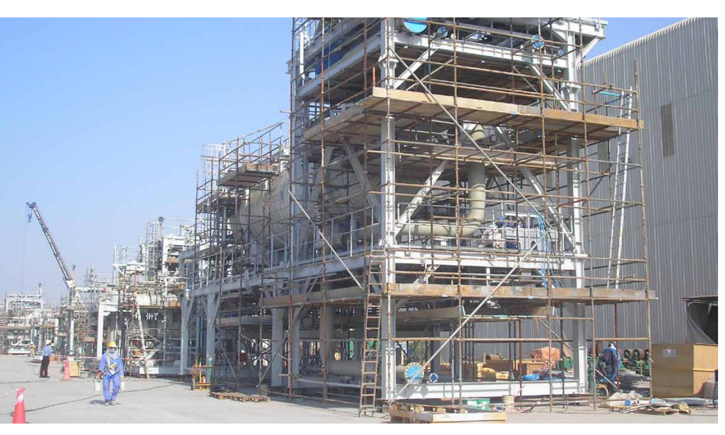
Series of skid modules