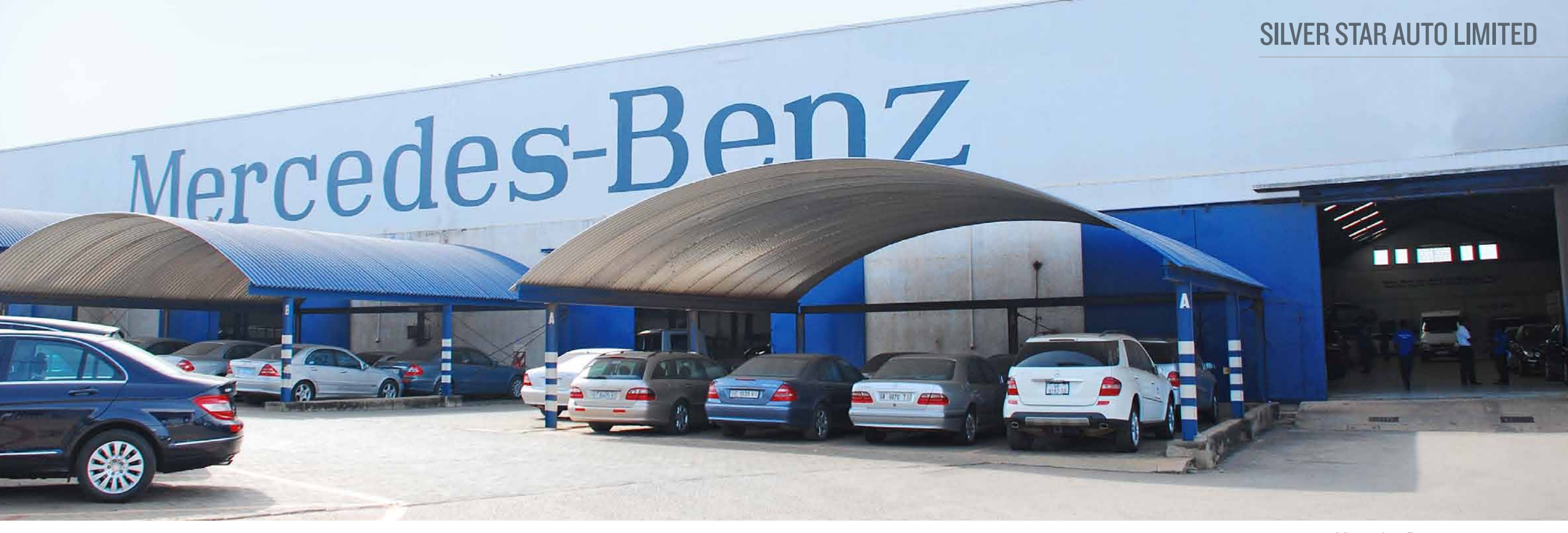
Mercedes-Benz service centre

Meanwhile, the company's vision is to be the premier automobile dealership in Ghana, providing exceptional value to its customers through services of the highest quality. The company is also committed to continuously increasing its market share in the