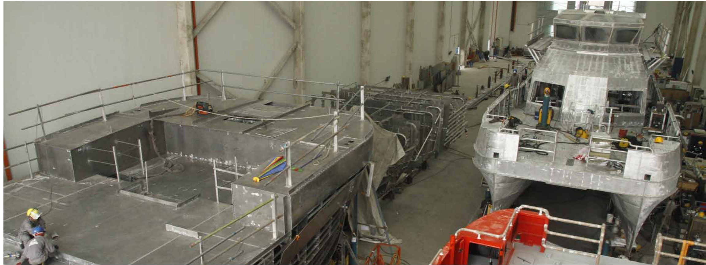
Strategic Marine provides its clients with turnkey shipbuilding, planned maintenance and ship repair services

The company’s move into the offshore wind sector went a step further in May 2012, when it announced the signing of a sales and service agency agreement with the marine