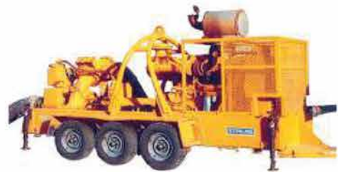
SPP SELF PRIMING DEWATERING PUMPS CAPACITY : 2550m 3 /hr, H=130m