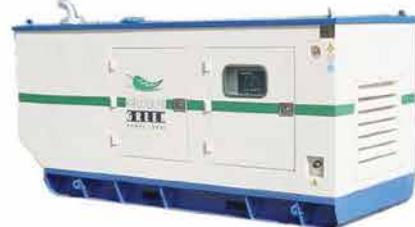
KIRLOSKAR GENERATORS 10 KVA -- 1000KVA