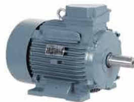
HIGH EFFICIENCY CROMPTON ELECTRIC MOTORS FOR MINING APPLICATION LV | MV | HT