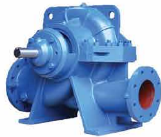
KIRLOSKAR HORIZONTAL SPLIT CASING PUMPS CAPACITY : 24000m 3 /hr, H=240m

SARO SUPPLIES & PROVIDES BACK UP FOR QUALITY WORLD RENOWNED, PROVEN EQUIPMENT BRANDS RELIABLE MACHINERY