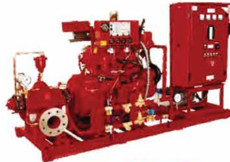
SPP FMUL APPROVED FIRE DIESEL PUMPS