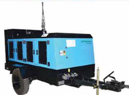
KIRLOSKAR AIR COMPRESORS